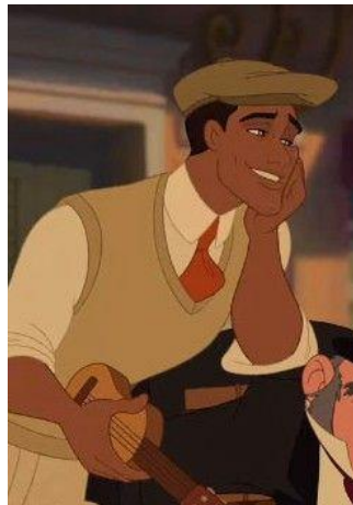
Picture 10. - The portrayal of Prince Naveen ("The Princess and the Frog", 2009)