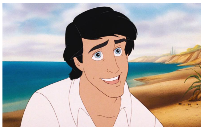
Picture 8. - The portrayal of Prince Eric ("The Little Mermaid", 1989)