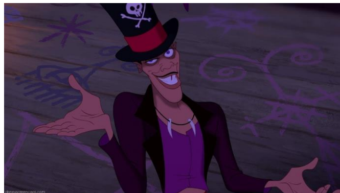
Picture 11. - The portrayal of Dr. Facilier ("The Princess and the Frog", 2009)