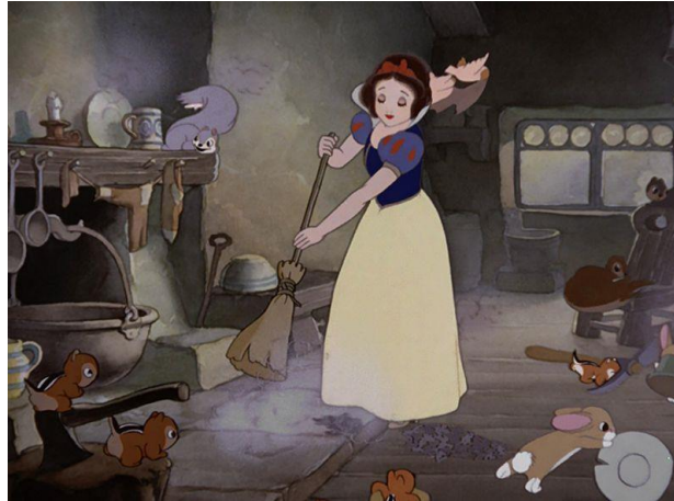
Picture 3. - The portrayal of Snow White ("Snow White and the Seven Dwarfs", 1937)