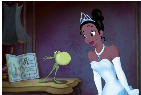
Picture 9. - The portrayal of Tiana ("The Princess and the Frog", 2009)