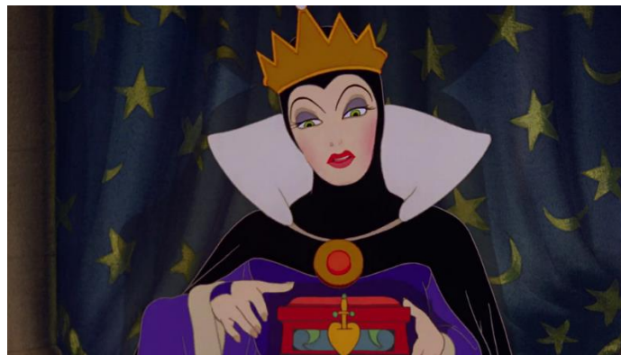
Picture 4. - The portrayal of an evil queen ("Snow White and the Seven Dwarfs", 1937)