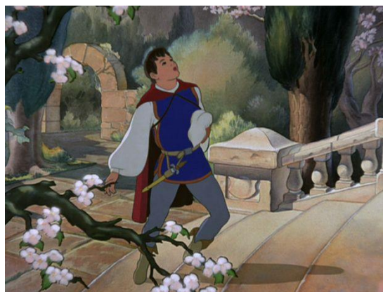
Picture 5 - The prince's portrayal in Snow White and the seven dwarfs ("Snow White and the Seven Dwarfs", 1937)