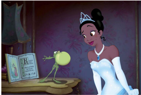
Picture 9. - The portrayal of Tiana ("The Princess and the Frog", 2009)