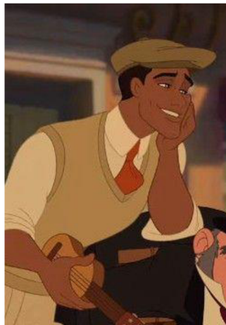
Picture 10. - The portrayal of Prince Naveen ("The Princess and the Frog", 2009)