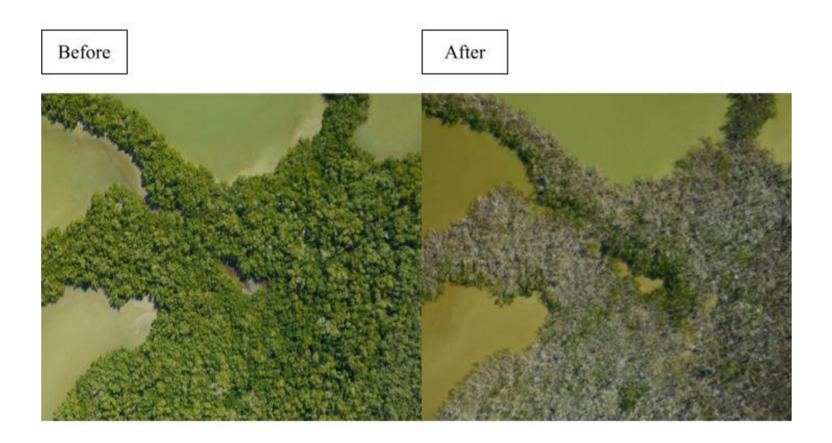
Figure 3. Before and After images of Florida's Everglades in September 2017 when hurricanes Irma and Maria destroyed large areas of Mangrove forests.

Mangrove forests thrive in wet, anaerobic environments that are characterised by elevated salinity, tides, heavy winds, and warm temperatures at the land-ocean transition in tropical and subtropical locations. Mangrove ecosystems are extremely vulnerable to climate change as these ecosystems already live at their limit (Kathiresan and Bingham, 2001). Mangrove forests have a specific tolerance to water level, with high water events or sea level rise these limits are exceeded causing mortality in both animal and plant communities. Due to climate change it is predicted that there will be an increase in storms and cyclones especially in coastal areas, which is the location of Mangrove forests. By dethatching of leaves and plant loss, the rising severity and magnitude of extreme weather events have the ability to worsen the harm done to marshes. Storms can affect the height of the forest sediments by surface runoff, soil accumulation, peat breakdown, and soil deformation which cause tree die-off and sulphide soil poisoning. These factors can permanently affect the whole Mangrove forest ecology (Gilman et al., 2008). Figure 3. Represents the damage done to Florida's Everglades in September 2017 when hurricanes Irma and Maria destroyed large areas of Mangrove forests (NASA, 2017).