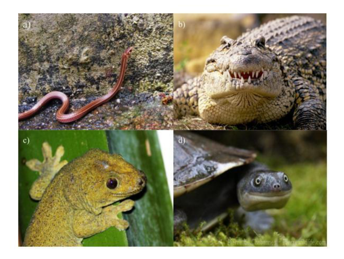
Figure 2. Critically endangered terrestrial and marine tropical reptile species due to climatic factors and extreme weather events. a) Three-Banded Centipede Snake, photo: Roland Rumm b) Cuban Crocodile, photo: Getty images c) Giant Bronze Gecko, photo: L.Chonseng d) Roti Snake-necked turtle, photo: Pierre de Chabannes

The Three-Banded Centipede snake belongs to the group of Colubrid snakes and are food specialists that only eat centipedes. They are endemic to Guanaja Island of Honduras. In addition to needing a special diet their climatic conditions are narrow (IUCN, 2023). The Cuban crocodile is known to reproduce annually, the time of it is affected by rainfall, available water in water bodies and the atmospheric and water temperature. Their restricted range is one of the primary risks to the natural community. Factors like infrastructure projects, wildfires, water contamination from industrial run-off into their nesting environments, habitat transition brought on by shifting water systems, invasive foreign species of vegetation and animals make them already vulnerable so adding the increasing pace of changes due to climate change could be lethal (Targarona et al., 2010). A significant threat to Roti Snake-necked turtles under global warming is from burning and increasingly frequent prolonged droughts. Turtles spend the dry season in thick vegetation or remain in the water. The responses said that human-caused fires in the surrounding of the water bodies killed or