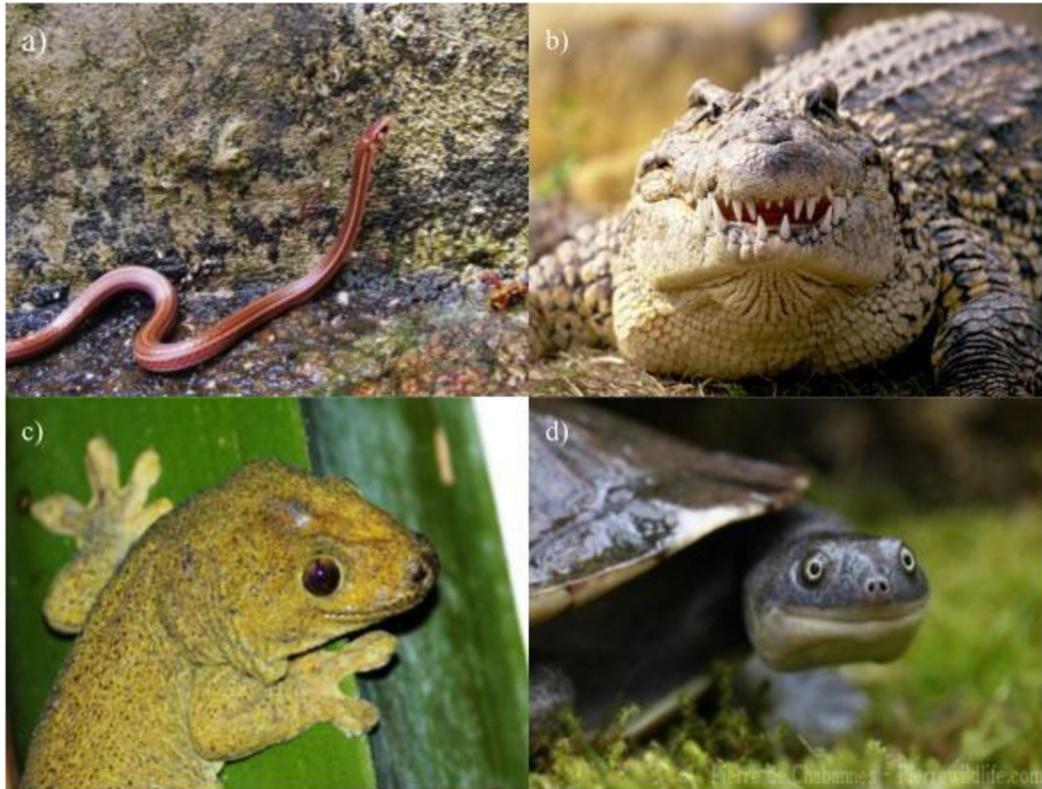
Figure 2. Critically endangered terrestrial and marine tropical reptile species due to climatic factors and extreme weather events. a) Three-Banded Centipede Snake, photo: Roland Rumm b) Cuban Crocodile, photo: Getty images c) Giant Bronze Gecko, photo: L.Chonseng d) Roti Snake-necked turtle, photo: Pierre de Chabannes

The Three-Banded Centipede snake belongs to the group of Colubrid snakes and are food specialists that only eat centipedes. They are endemic to Guanaja Island of Honduras. In addition to needing a special diet their climatic conditions are narrow (IUCN, 2023). The Cuban crocodile is known to reproduce annually, the time of it is affected by rainfall, available water in water bodies and the atmospheric and water temperature. Their restricted range is one of the primary risks to the natural community. Factors like infrastructure projects, wildfires, water contamination from industrial run-off into their nesting environments, habitat transition brought on by shifting water systems, invasive foreign species of vegetation and animals make them already vulnerable so adding the increasing pace of changes due to climate change could be lethal (Targarona et al., 2010). A significant threat to Roti Snake-necked turtles under global warming is from burning and increasingly frequent prolonged droughts. Turtles spend the dry season in thick vegetation or remain in the water. The responses said that human-caused fires in the surrounding of the water bodies killed or