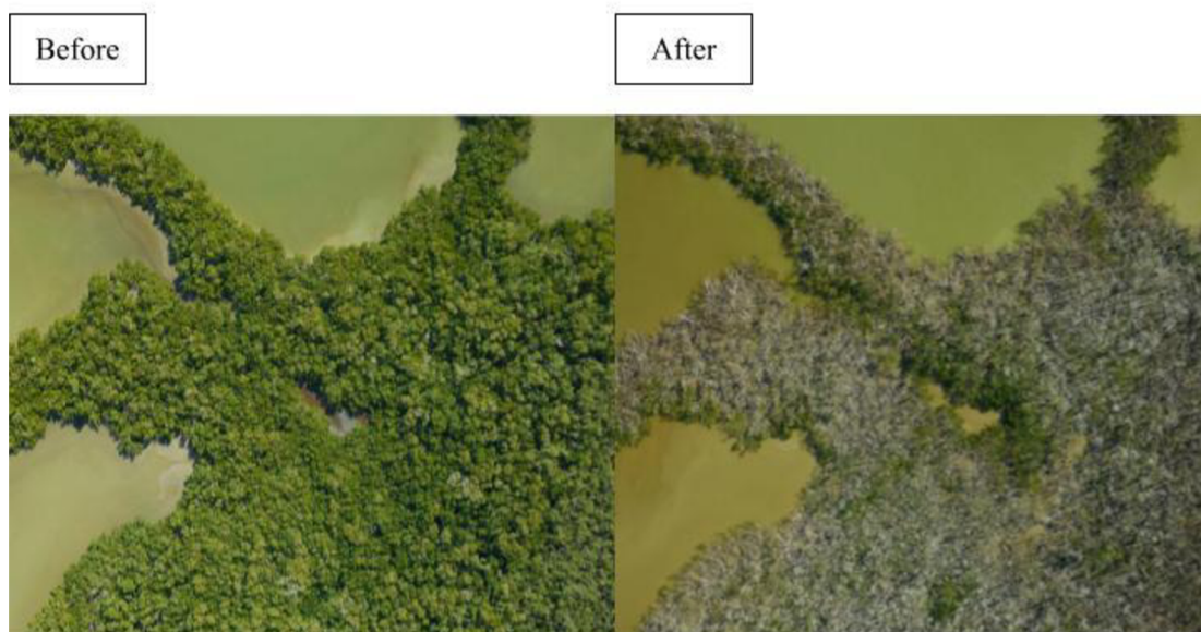
Figure 3. Before and After images of Florida's Everglades in September 2017 when hurricanes Irma and Maria destroyed large areas of Mangrove forests.

Mangrove forests thrive in wet, anaerobic environments that are characterised by elevated salinity, tides, heavy winds, and warm temperatures at the land-ocean transition in tropical and subtropical locations. Mangrove ecosystems are extremely vulnerable to climate change as these ecosystems already live at their limit (Kathiresan and Bingham, 2001). Mangrove forests have a specific tolerance to water level, with high water events or sea level rise these limits are exceeded causing mortality in both animal and plant communities. Due to climate change it is predicted that there will be an increase in storms and cyclones especially in coastal areas, which is the location of Mangrove forests. By dethatching of leaves and plant loss, the rising severity and magnitude of extreme weather events have the ability to worsen the harm done to marshes. Storms can affect the height of the forest sediments by surface runoff, soil accumulation, peat breakdown, and soil deformation which cause tree die-off and sulphide soil poisoning. These factors can permanently affect the whole Mangrove forest ecology (Gilman et al., 2008). Figure 3. Represents the damage done to Florida's Everglades in September 2017 when hurricanes Irma and Maria destroyed large areas of Mangrove forests (NASA, 2017).