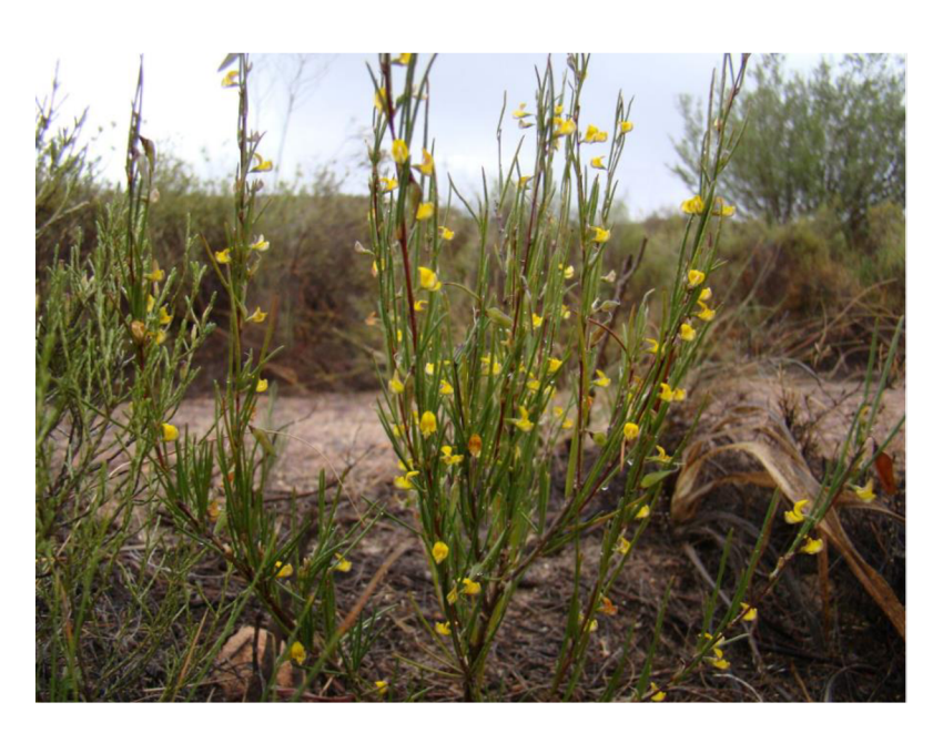
Figure 2: Aspalathus linearis (Burm.f.) R.Dahlgren (Erasmus 2018)

Aspalathus linearis (Figure 2) from the Fabaceae family, the source of rooibos tea, is an endemic South African fynbos species (Joubert & de Beer 2011). It is erect to spreading shrub or shrublet up to 2 m high with reddish branches, with green, needle-like leaves. Leaves are 1.5-6 cm long and 0.1 cm thick, have no stipules and may be densely clustered. The flowers are yellow, solitary or arranged in dense groups at the tips of branches, and bloom in spring to early summer. The fruit is a small lanceolate pod usually containing 1 or 2 seeds (Govender 2007).