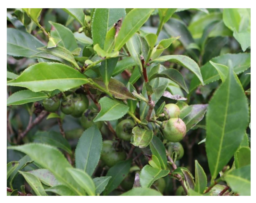
Figure 3: Camellia sinensis (L.) Kuntze (Kew Royal Botanical Gardens 2022)

Camellia sinensis (Figure 3) or Thea sinensis is a species from Camelliaceae (Theaceae) family. This species is known worldwide as a tea plant. It is an evergreen, branched shrub up to 3 meters high (var. sinensis) or a 10 to 15 m tall tree (var. assamica). When cultivated, the tea plant is pruned to 1 to 1.5 m to support branching and spreading shrubs. The tea plant has a strong taproot and many lateral roots which create a dense mat in the top 50 to 75 cm of the soil. Leaves are alternate with short petiole and lanceolate to obovate blade. In var. sinensis the leaves are usually leathery and narrow, dark green, not longer than 10 cm, and with indistinct marginal veins. In var. assamica the leaves are thinner, wider, and longer (15 to 20 cm). The colour is lighter and marginal veins are more distinct. Flowers are axillary, arranged singly or in clusters. Fruit is a subglobose capsule (Schoorel & van der Vossen 2000).