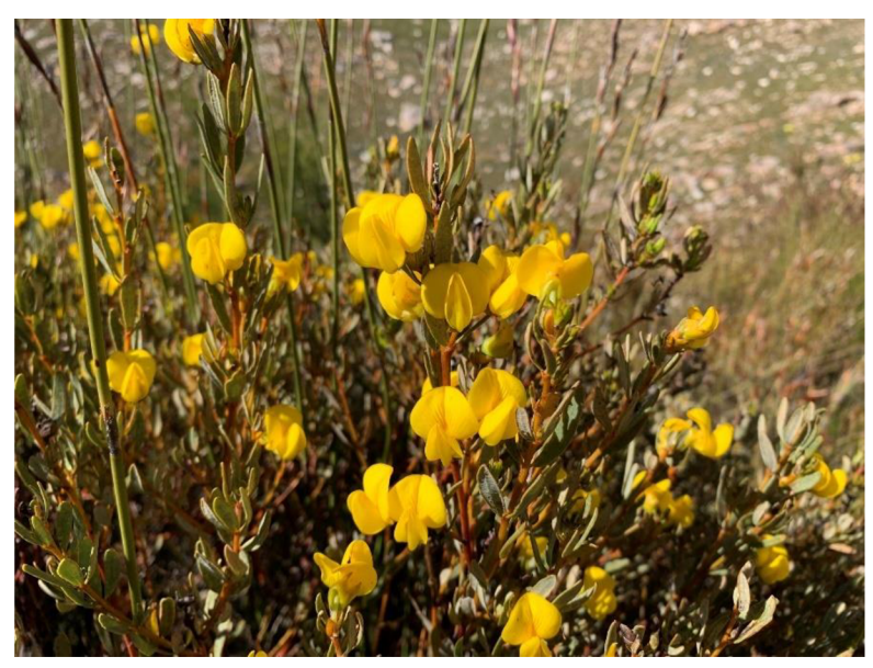
Figure 4: Cyclopia intermedia E.Mey. (Hurt 2022)

In South Africa, 3 major species of Cyclopia are used to produce tea – Cyclopia genistoides (L.) R.Br. (honeybush tea), Cyclopia intermedia E. Mey. (berg tea, Kouga berg tea), and Cyclopia subternata Vogel (vlei tea). Small quantities of honeybush tea