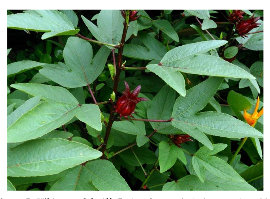
Figure 5: Hibiscus sabdariffa L. (Useful Tropical Plant Database 2022)

Hibiscus sabdariffa (Figure 5), also known as Jamaica sorrel, karkade, roselle, or sour tea is a species from the family Malvaceae, cultivated in tropical Asia and America, but mostly in Africa (Egypt, Sudan) where it originates. Roselle grows naturally in dry, subtropical, mountain climates (Guardiola & Mach 2014). It is an annual to perennial plant with an erect, mostly branched stem that grows up to 4.5 m high. Leaves are heart-shaped or lobed. Flower calyces are pink to red coloured when mature and after flowering they become fleshy with a sour taste. They are produced all year round and contain about 30 % of acids, especially citric acid, hibiscus acid, malic acid, and tartaric acid. Fruit is an ovoid, obtuse capsule containing 30-40 small seeds (Hušák & Valíček 2002).