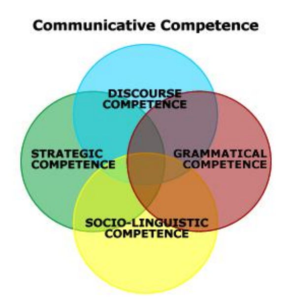
Figure 1: Graphic representation of four areas of communicative competence (Susanto, 2017)

All the abilities described above could be simply covered by the term communicative competence. The discussion about communicative competence originated in the 1970s when Dell Hymes reacted to a famous linguist Noam Chomsky. Hymes criticized Chomsky's view of language competence for a lack of sociocultural aspects and created a base for the current view of communicative competence (Tarvin, 2014, pp. 2-4). Mezrigui (2011, pp. 73-75) divides communicative competence into four sub-competencies – grammatical competence, discourse competence, sociolinguistic competence, and strategic competence. By acquiring all of these, the learner can become a proficient language user (Mezrigui, 2011, p. 73).