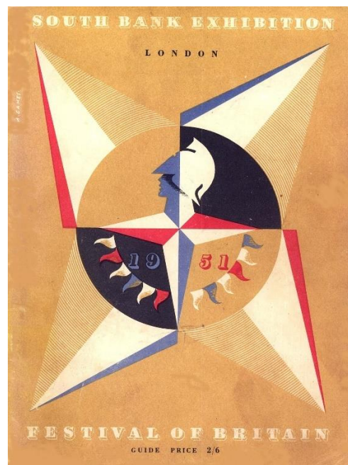
Figure 3: Festival Emblem from the cover of the South Bank Exhibition Guide, 1951 (Wikipedia, 2022)

Due to the fact that the Festival was not a single-place event, a symbol needed to be created to unify the scattered venues (Atkinson, 2012 p. 19). It represented „ the profile of Britannia above a compass star with a lower border of pennants “ (Turner, 2011 p. 56)“, all in blue, red and white as a reference to the Union Jack and designed by Abram Games. The emblem brought great popularity since it marked everything connected with the Festival, from events, souvenirs to stamps or even flower beds, which were cut to its image (Atkinson, 2012 pp. 19, 20).