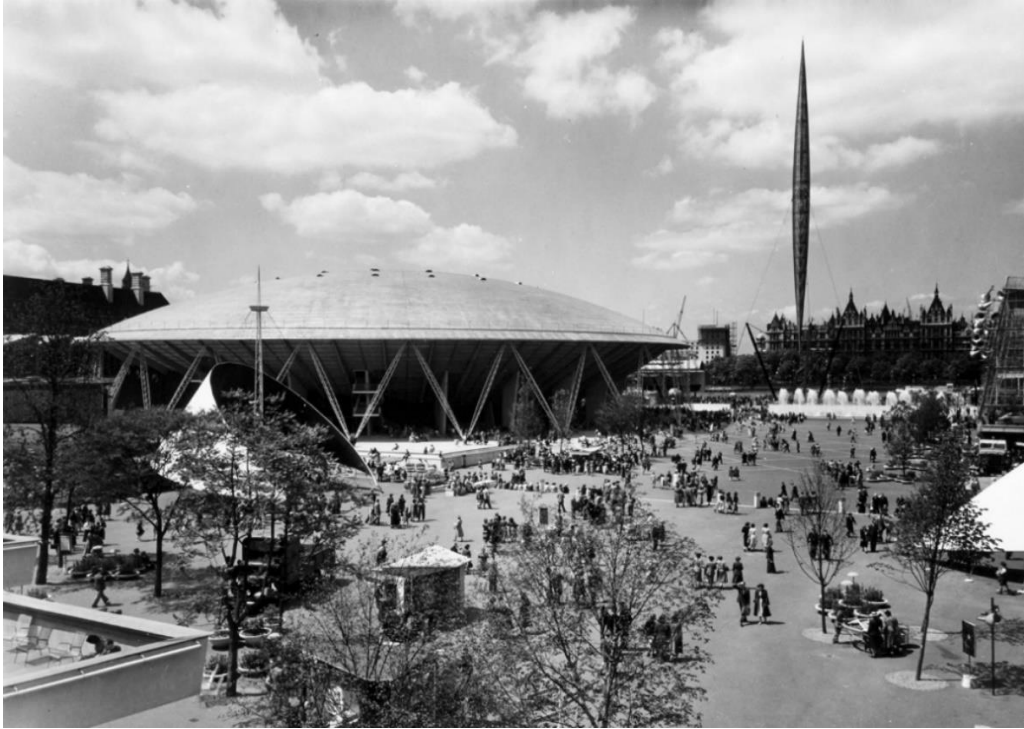
Figure 4: South Bank with Skylon and Dome of Discovery

Downstream, there was a Festival Hall focused more on the people with its exhibitions of arts and crafts, education or the English at home (Turner, 2011 p. 52). It was the only building that remained after the Festival. The rest were temporary (Atkinson, 2012). Another building that people could visit downstream was The Lion and Unicorn pavilion. The name had a symbolic meaning for the qualities of a nation, where the Lion stood for realism and strength and the Unicorn for fantasy, independence and imagination 16 . The display focused on the English language, eccentricity, craftsmanship, country life and instinct of liberty (Conekin, 2003 pp. 94-98). The film had been an integral part of British culture and very popular since the 1930s. For that reason, it also found representation on the South Bank in the form of the Telekinema, organised and established by the British Film Institute. It offered stereophonic films and documentaries (Easen, 2018). An imitation of vacation was created along the river with the typical holiday scenery as a promenade, deckchairs, ice cream stalls and sunshades (Turner, 2011 p. 52). When the sun went down, the entire South Bank lit up with lights. Everything was illuminated, the buildings, pathways, trees, ponds and fountains