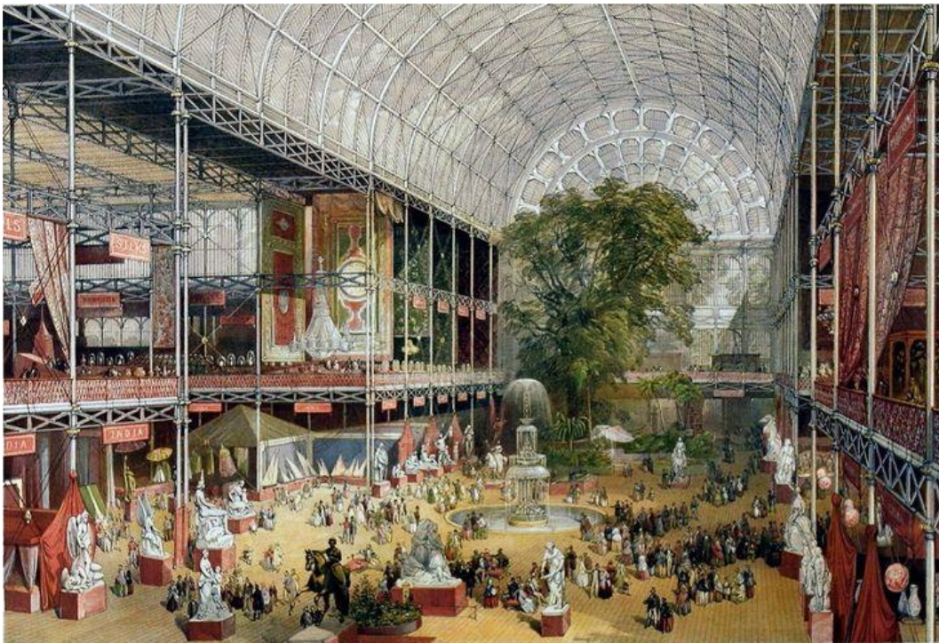
Figure 2: The transept, seen from the Grand Entrance (Craig, 2017)

was completed with the four-part categorisation: Raw Materials , Machinery , Manufactures and Fine Arts , which was Albert's idea to represent the product path from its very origin to the form delivered to the customer. The British liked the organization and for that reason, they decided to extend it even further into the final 30-class taxonomy (Shears, 2017 pp. 108-110).