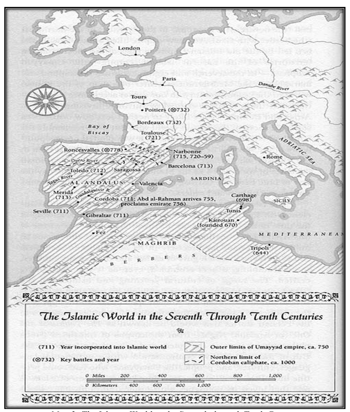
Map 2: The Islamic World in the Seventh through Tenth Centuries. NB: It should be noted that the Islamic World extends further East. For the purposes of this paper, only the part of the map that pertains to the Iberian Peninsula is included.

proper (from the Arabian Peninsula) who were often the minority. The fact that power and control were in the hands of the proper Arab minority undermined the ummah , which was "like a large and expanding tribe in the sense that all men were members of