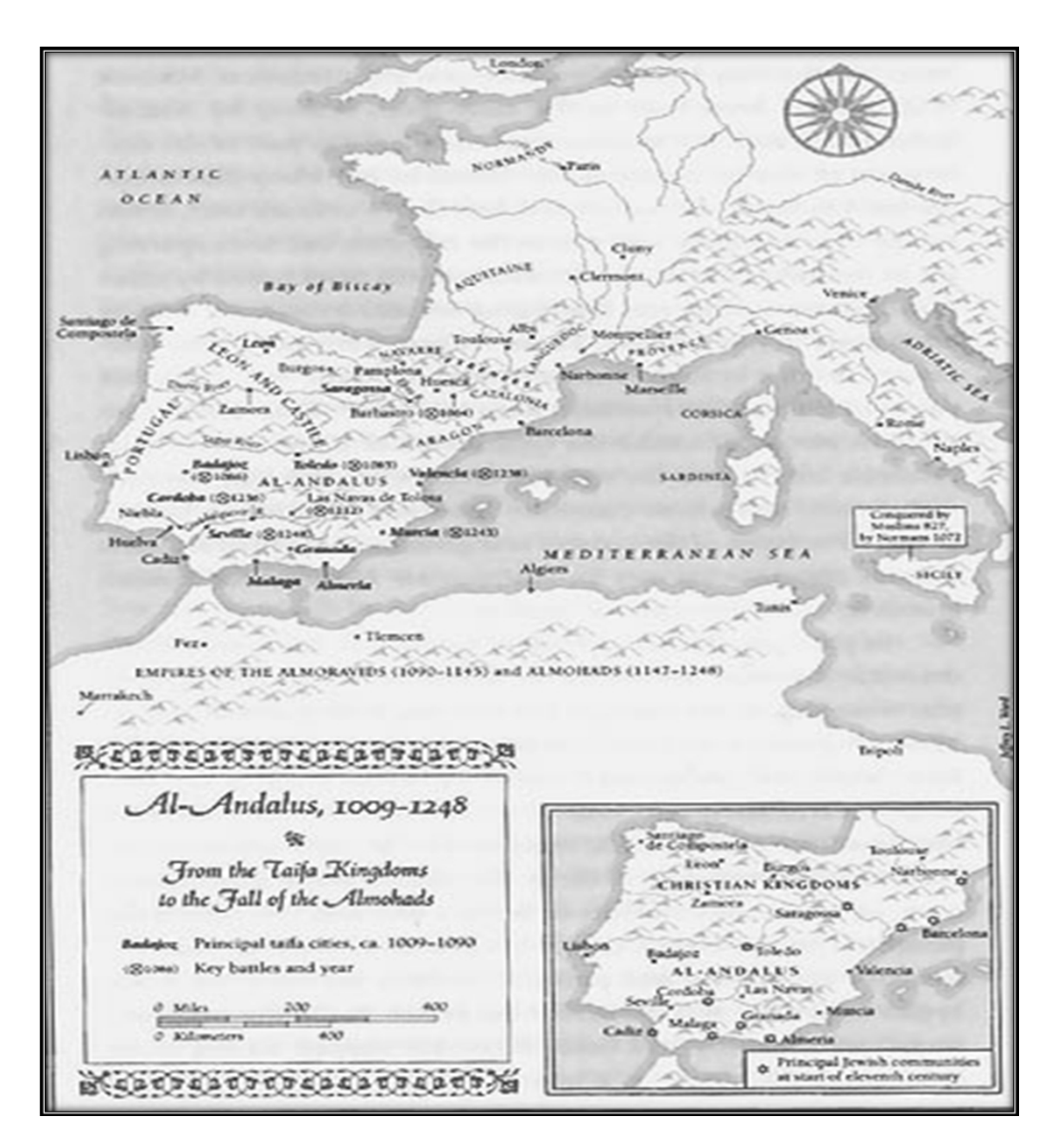
Map 3: The Disintegration of al-Andalus into Taifa Kingdoms

laissez faire of the taifa kings;" – an opinion which they shared with the Muslim Andalusian masses.<sup>32</sup> Requested to act as reinforcements, the Almoravids overthrew the party kings and united al-Andalus for themselves. By pushing back the forces of Alfonso VI in 1086; the Almoravids momentarily quelled any further advancement. The Almoravids ruled Al-Andalus markedly different manner than that of the