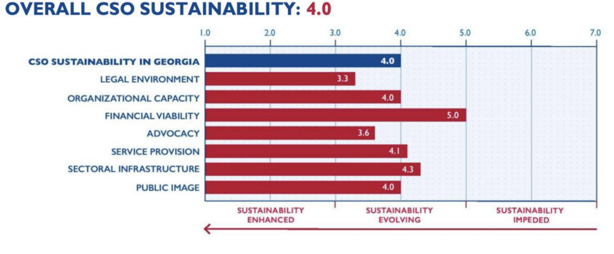
Figure 3: CSO Sustainability in Georgia (Source, USAID 2020)