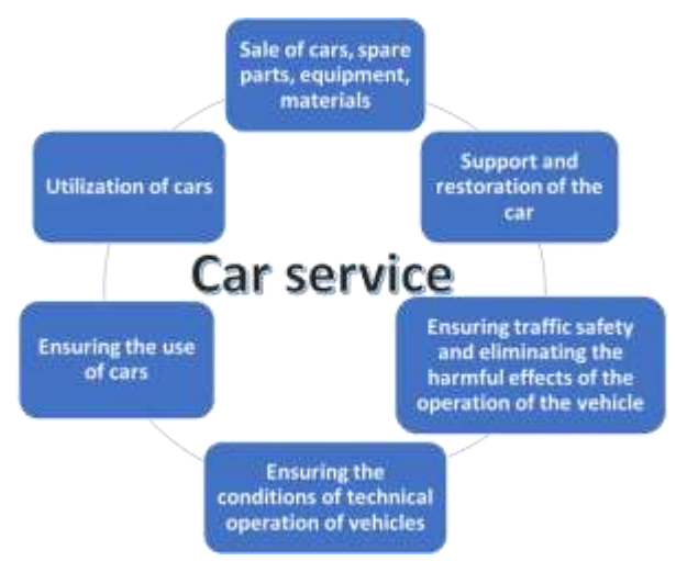
Figure 3 Car service as a road transport infrastructure