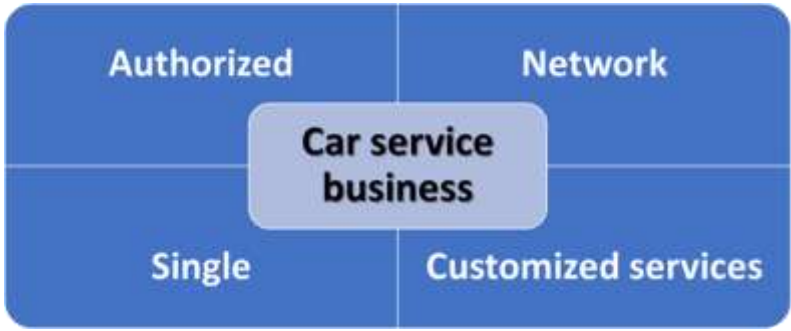
Figure 4 Types of car service business