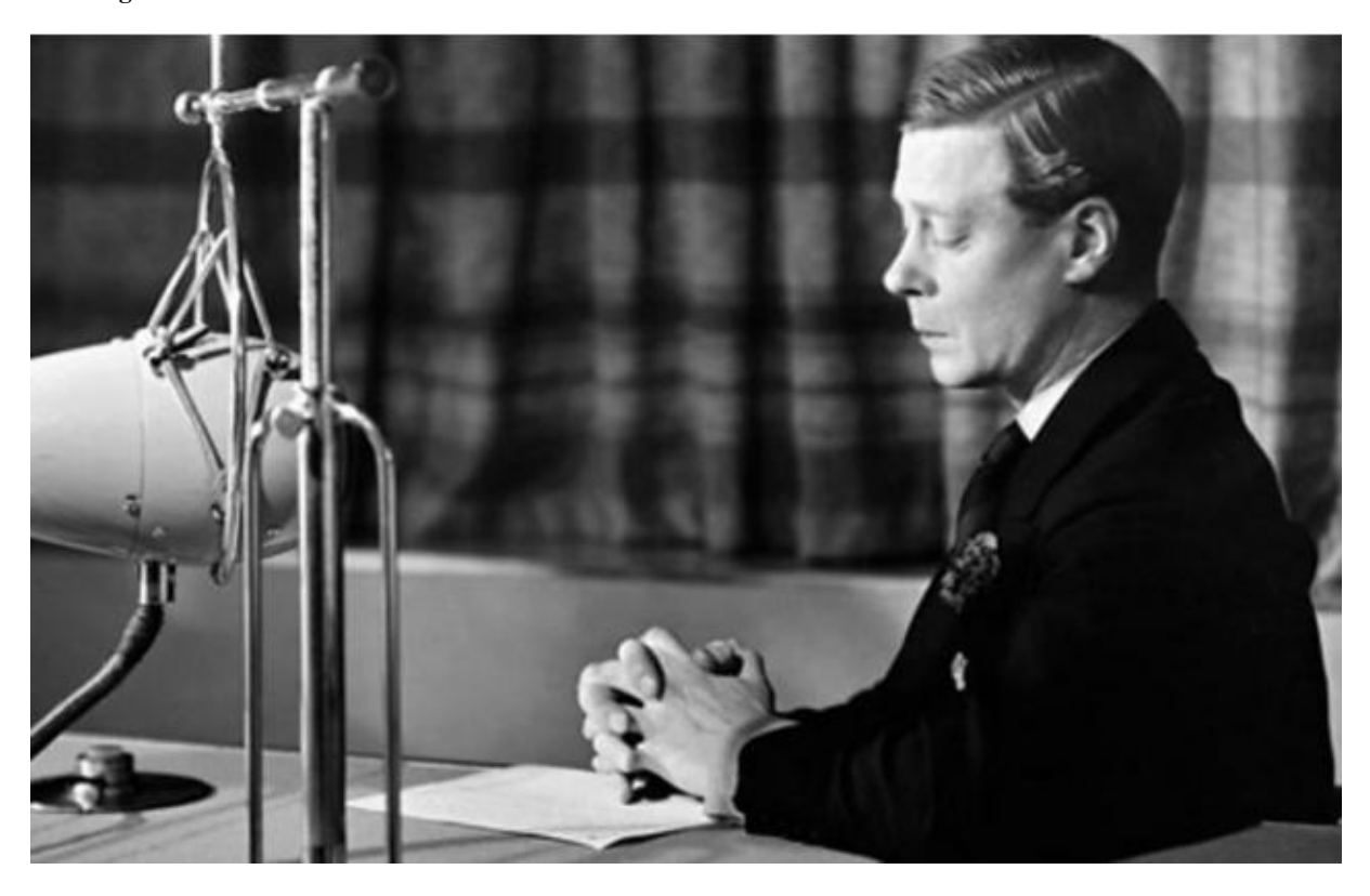
Figure 1 Edward VIII The Prince of Wales