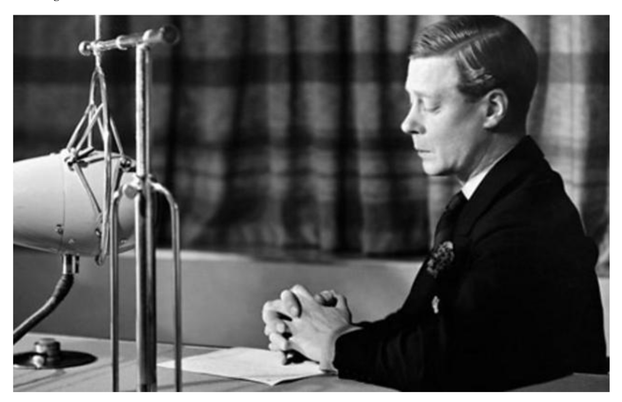
Figure 1 Edward VIII The Prince of Wales