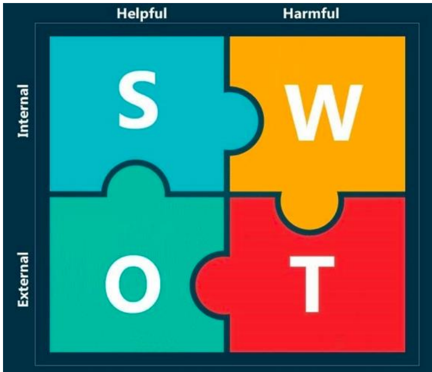
Figure 1 - SWOT Analysis:

SWOT analysis is very useful and easy to make and shows key information about the company.