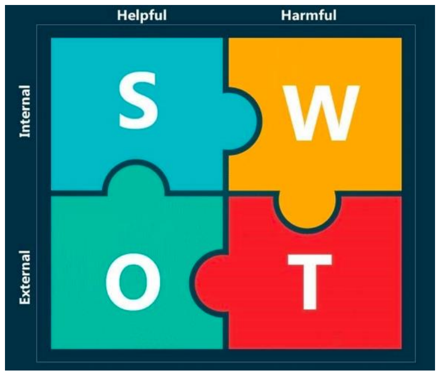
Figure 1 - SWOT Analysis:

SWOT analysis is very useful and easy to make and shows key information about the company.