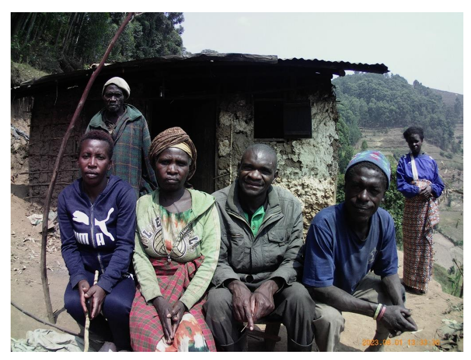
Appendix Figure 4: Batwa in Karengyere