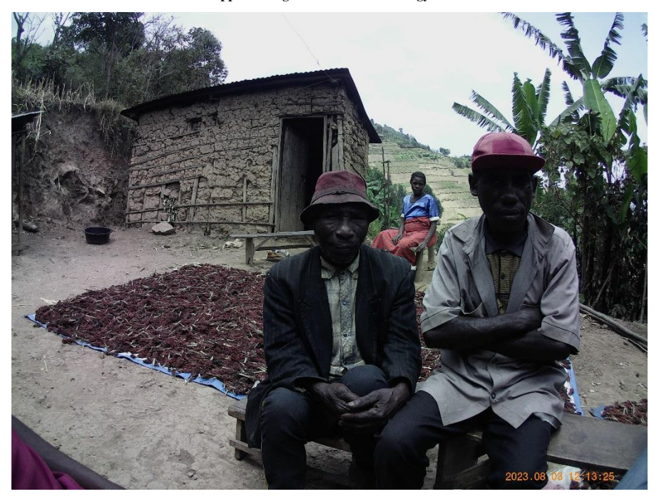
Appendix Figure 5: Batwa in Mukungu