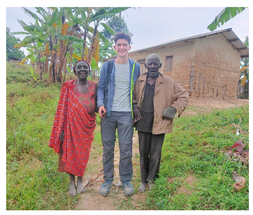
Appendix Figure 6: Batwa elderly and researcher in Nyabaremura