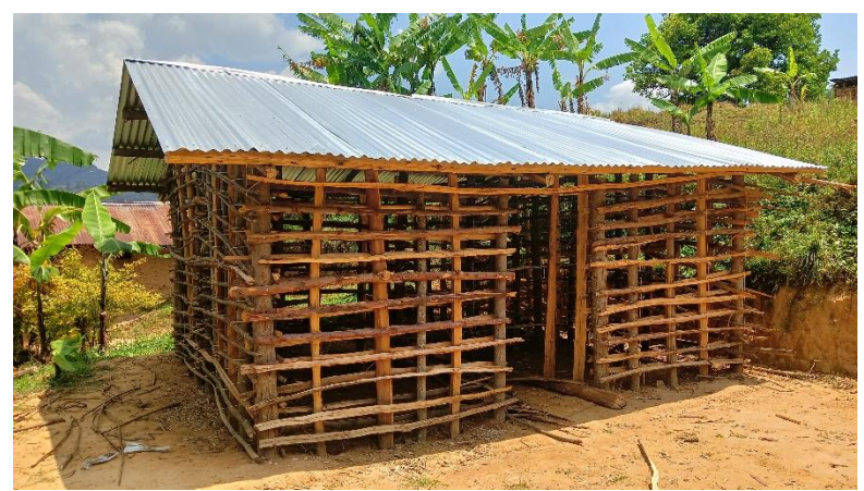
Appendix Figure 10: Mud house construction in Nyabaremura