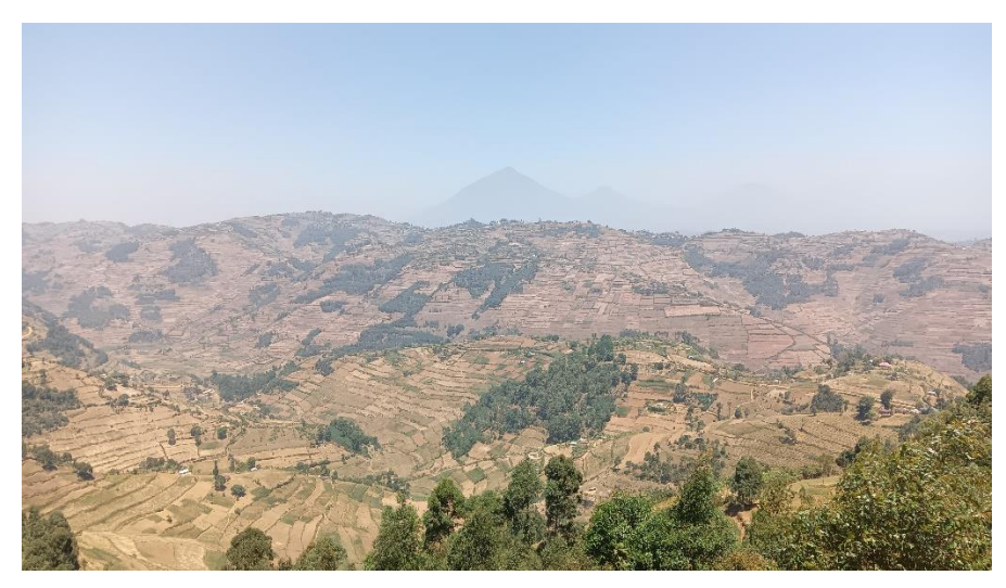
Appendix Figure 1: Glimpse on Mount Muhabura, Kisoro district