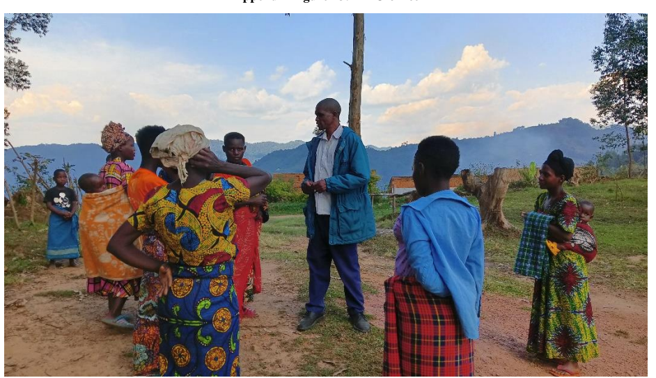
Appendix Figure 14: Batwa after dancing in a Batwa cultural trail in Nteko, in proximity of the DRC border