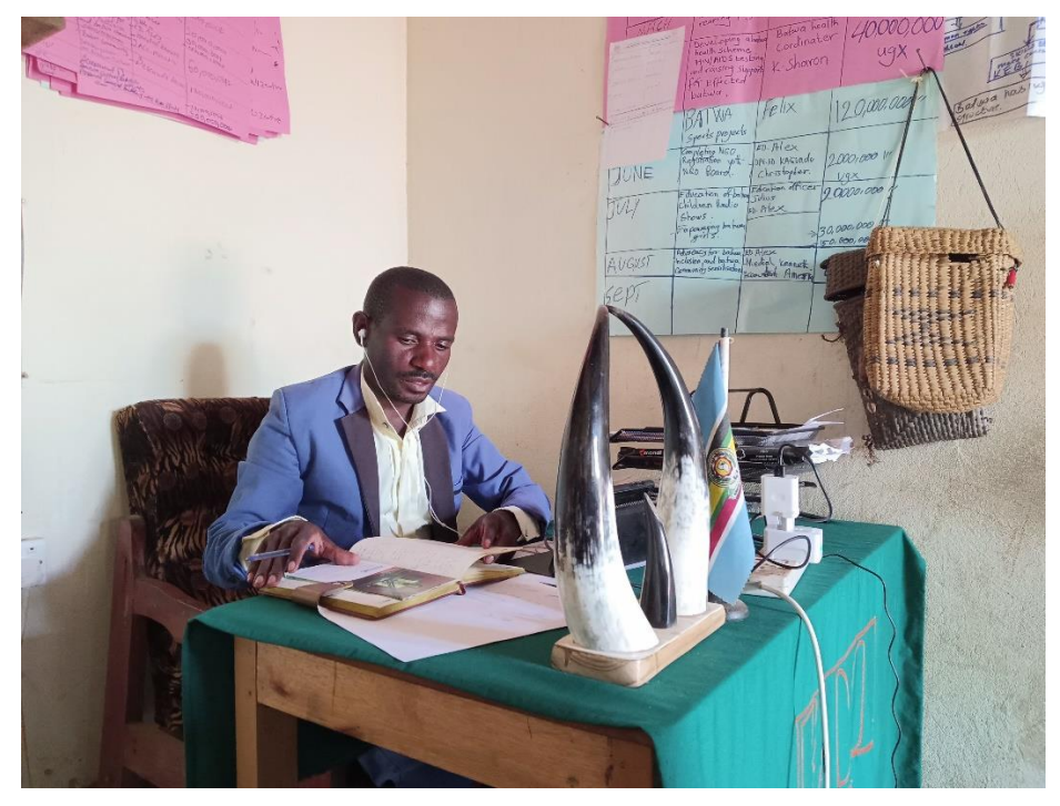
Appendix Figure 13: BIDO office