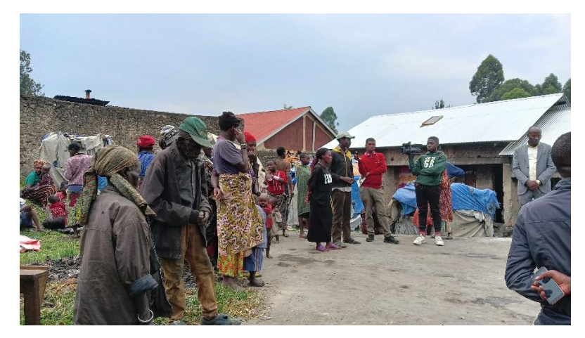
Appendix Figure 8: Batwa welcoming a governmental delegation in Michingo