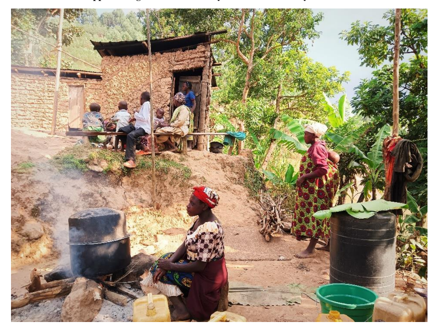
Appendix Figure 7: Daily life in Mukungu