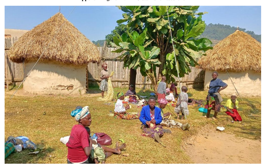
Appendix Figure 12: Batwa handcrafting in Nkuringo Cultural Centre, Rubuguli