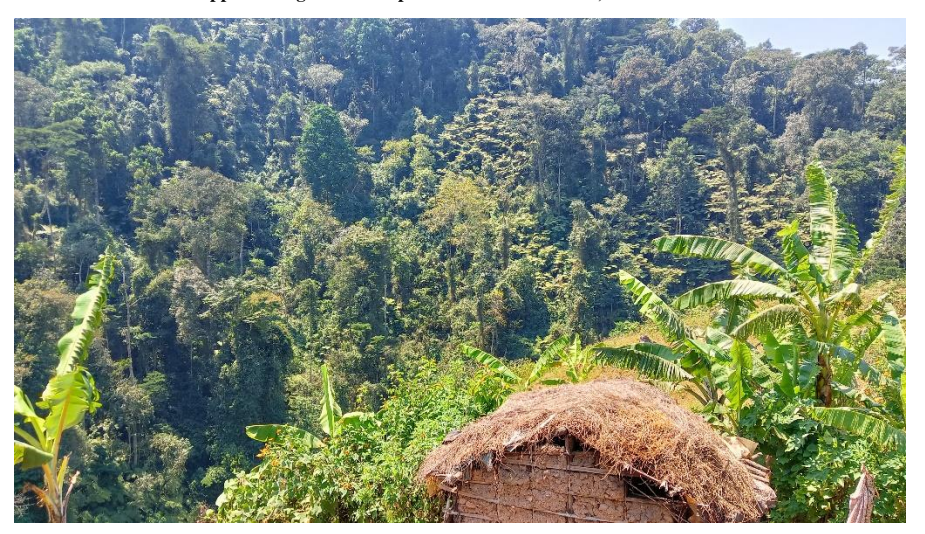
Appendix Figure 2: Mud house in Byabitukuru, on the edges of the Bwindi Impenetrable National Forest