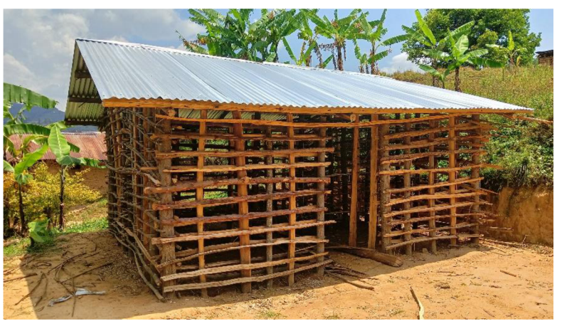
Appendix Figure 10: Mud house construction in Nyabaremura