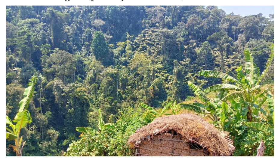
Appendix Figure 2: Mud house in Byabitukuru, on the edges of the Bwindi Impenetrable National Forest