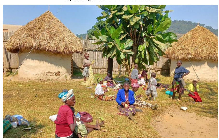
Appendix Figure 12: Batwa handcrafting in Nkuringo Cultural Centre, Rubuguli