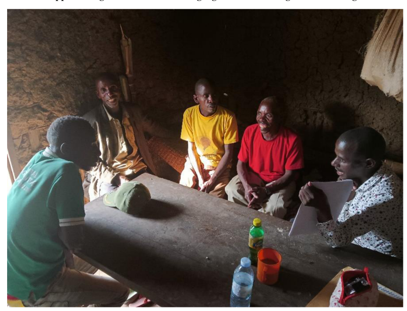
Appendix Figure 9: Community sensitisation by BIDO in Nteko