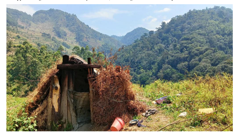
Appendix\ Figure\ 3: Improvised\ hut\ in\ By abitukuru,\ on\ the\ edges\ of\ the\ Bwindi\ Impenetrable\ National\ Forest