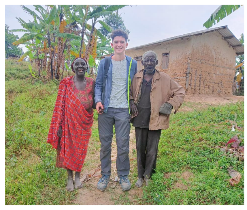
Appendix Figure 6: Batwa elderly and researcher in Nyabaremura