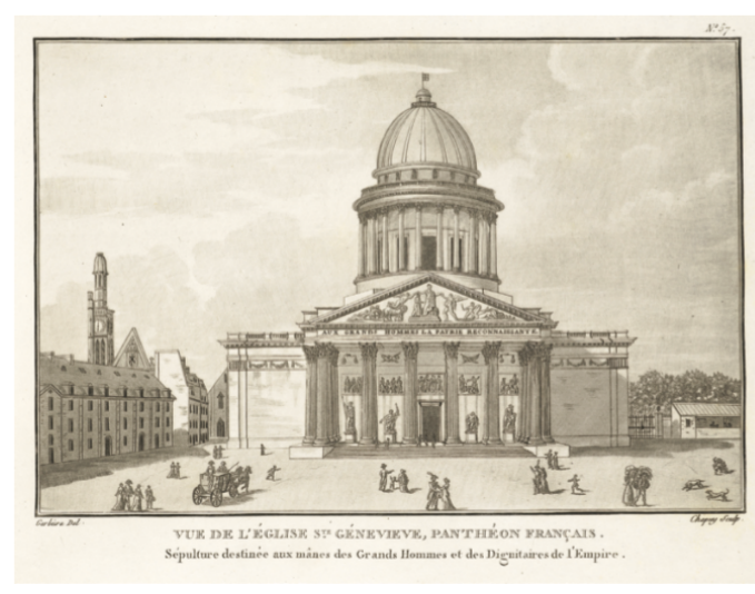
Figure 3: Panthéon in 1810, Hannah Williams, "Saint Geneviève's miracles: art and religion in eighteenth-century Paris," (French History, Vol. 30, No. 3 (Oxford University Press, 2016: 347).

Soufflot's original plans differed from the final outlook of the building. His idea was to combine the ancient temple-structure with structures reminiscent of Gothic cathedrals, in order to open up the church for light by creating height and spaciousness. This was done by coiffing his columns with complex vaulting and a dome. The Greek cross-plan would reach, with its Corinthian entrance portico, to the entire end of the western-facing arm.<sup>27</sup> Lightness of the church's interior was accentuated by isolating the piers supporting the dome. In this first design,