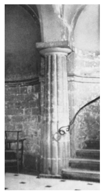
Figure 4: Tuscan column in the crypt in 1773, bare of decoration, in: Allan Braham, "Drawings for Soufflot's Sainte Geneviève," In: The Burlington Magazine, Vol. 113, No. 823, (Burlington Magazine Publications Ltd., 1971): 587.

the dome was constructed over a columned drum as a double shell. The ovals of this drum would cast light between these two shells, while the windows below would light the church's crossing. In his articulation of the drum and pairs of columns on four diagonal axes, he takes an unusual approach at that time, being inspired by the dome of Les Invalides. Notwithstanding, while the dome of Les Invalides is recognized with a ribbed cupola, Soufflot's dome would be a smooth hemisphere of a more classical shape, after which the name 'Temple de Sainte-Geneviève' did not derive suddenly.<sup>28</sup> The original crypt included columns inspired by the Doric order; they differed from the Greek order mainly because of its low pedestals and base mouldings, and he omitted a transitional stage between the column's shaft and the base on which it rested.<sup>29</sup> Notwithstanding, the final columns of its crypt were closer to Tuscan columns as they were unfluted and bare of decoration, which can be seen in figure 4. On the outside and inside of the building, the ancient temple-