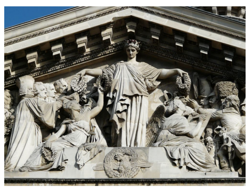
Figure 8: Pierre-Jean David d'Angers' pediment for the Parisian Panthéon from 1837, in: "L'aventure rocambolesque du fronton du Panthéon," by Un Jour de Plus A Paris, https://www.unjourdeplusaparis.com/paris-culture/histoire-fronton-pantheon.

pantheon nowadays. David d'Angers' affinity with ancient architecture ensured the building remained its ancient outlook. As he had won the prix de Rome in 1811, the state had entrusted him to sculpture many important pieces, such as the Grand Condé (for what is now the Pont de la Concorde) and the tomb for General Bonchamps. In 1826, he had been appointed to the faculty of the Ecole des Beaux-Arts and in 1827, he had been elected to the Académie. Now in 1837, he had completed the pediment for the Parisian Panthéon.