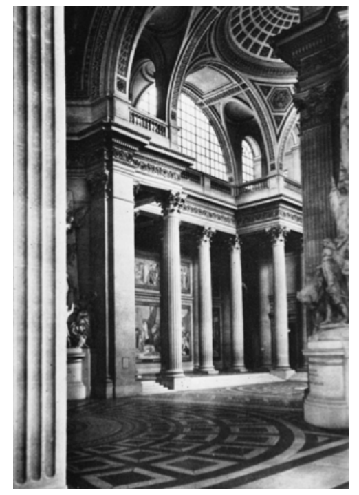
Figure 6: Corinthian columns inside the Saint-Geneviève church-Parisian Panthéon, in: Allan Braham, "Drawings for Soufflot's Sainte Geneviève," In: The Burlington Magazine, Vol. 113, No. 823, (Burlington Magazine Publications Ltd., 1971): 592.