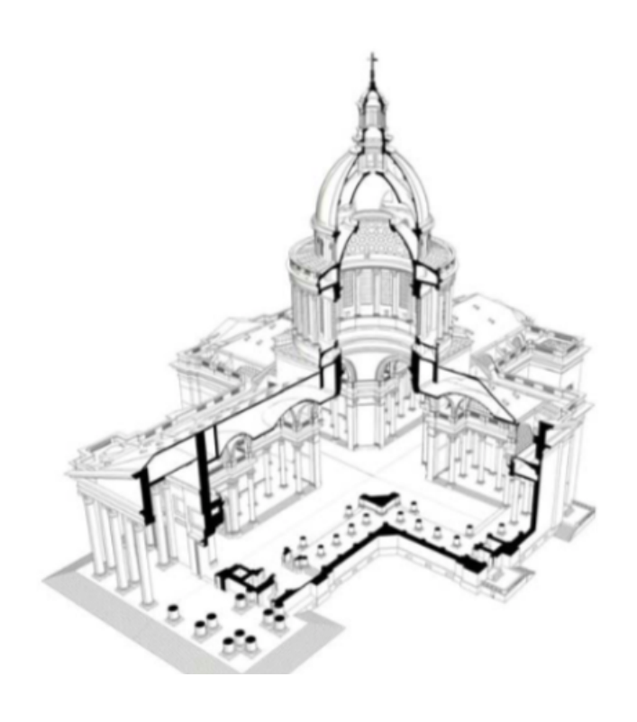
Figure 1: Axonometry of the Panthéon with cross-shaped floor plan and inside, (C. Blasi, E. Coïsson, "The importance of historical documents for the study of stability in ancient buildings: the French Panthéon case study," vol. 7, no. 4, (Asian Journal of Civil Engineering (Building and Housing), 2006): 361).

Inspirations for the building were the Saint Peter's in Rome (1505/06), the unexecuted Great Model for London's Saint Paul's by Christopher Wren (designed in 1669; cathedral built in 1675-1711) and the Dôme