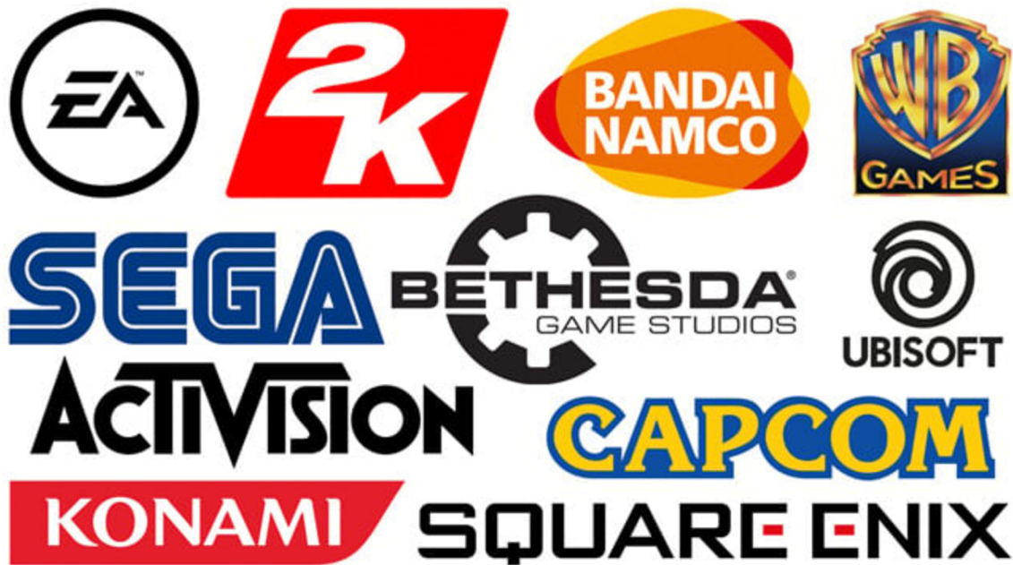
Figure 4, the biggest game developers