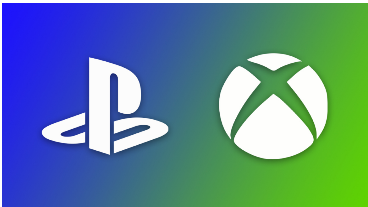
Figure 5, PlayStation and Xbox logos