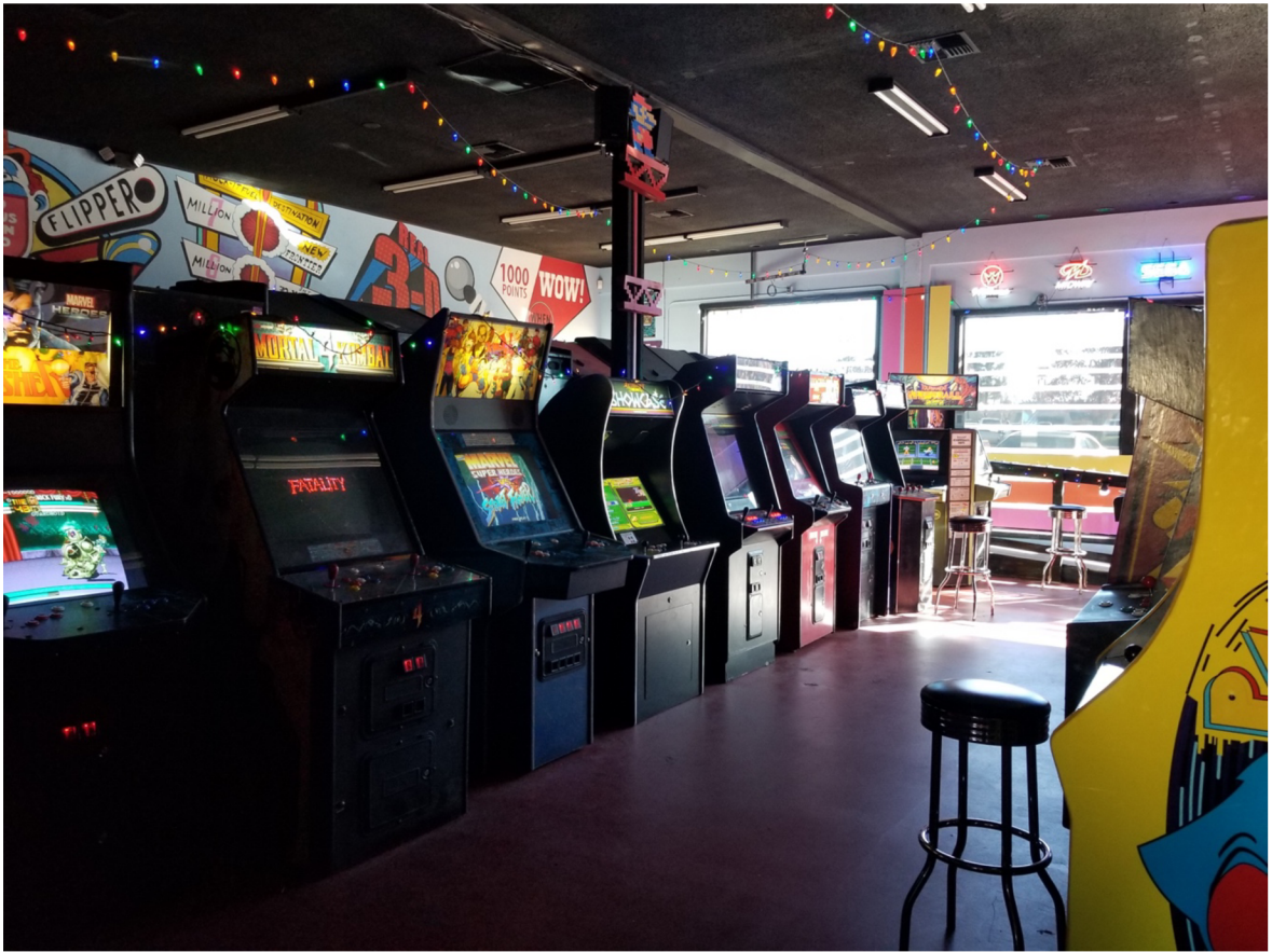
Figure 1, an example of a retro arcade