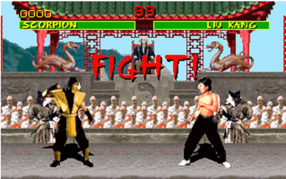
Figure 2, a screenshot from Mortal Combat