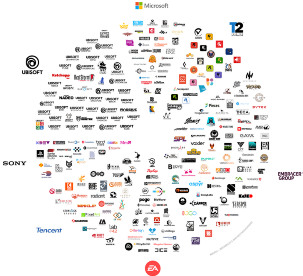
Figure 8, gaming companies and their subsidiaries