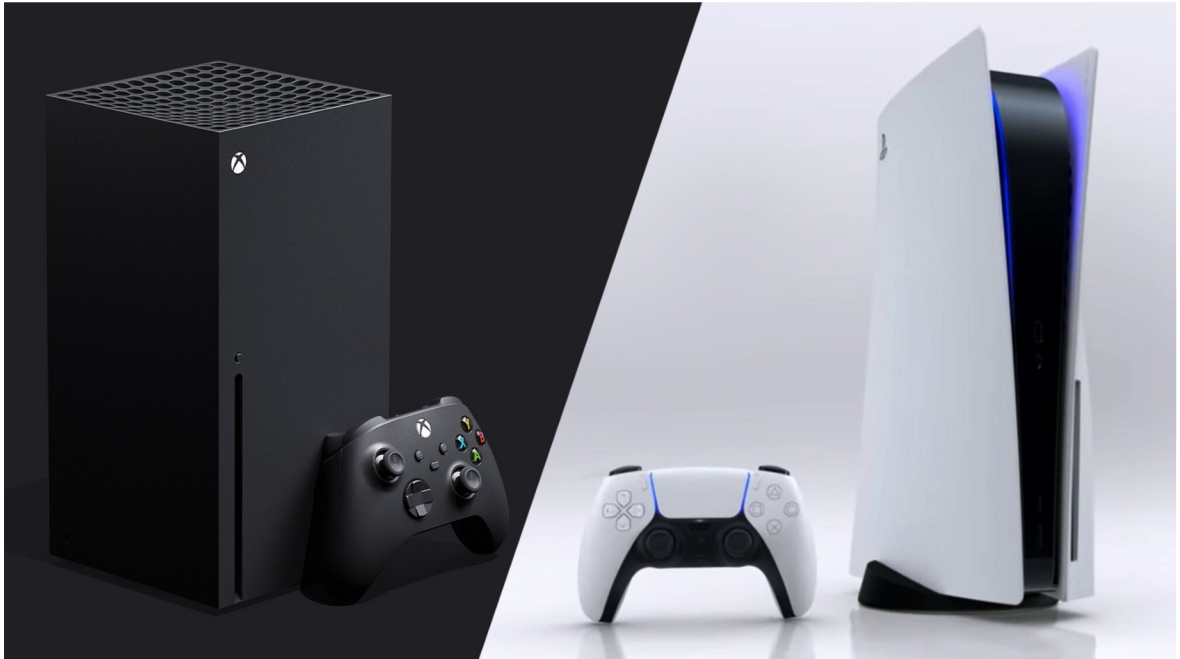
Figure 7, the main gaming consoles of 2022