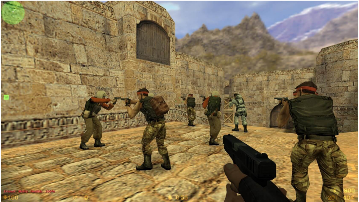
Figure 3, a screenshot from Counter Strike 1.6

split, but also games themselves were soon to be split into single-player ones and online games, where the second segment gained real sympathy by players all over the world. Notably, the commercial success of the Counter-Strike series and notably Counter-Strike 1.6 which was released in 1999 was something that created an entirely new domain that partially alone led to the creation of cybersports (Witkowski, 2019).