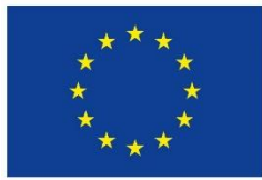
Figure 1. Erasmus+ logo, European Commission, retrieved on April 8, 2023, https://ec.europa.eu/assets/eac/promo/erasmus-plus-toolkit-20131031_en.pdf

The name “Erasmus” is a short version of “EuRoPean Community Action Scheme for the Mobility of University Students” 1 . It is named after Renaissance philosopher and Christian scholar Erasmus of Rotterdam. The Erasmus mobility programme is the widest network of collaborations between higher education institutions in Europe (Gadár, Kosztyán, Telcs, & Abonyi, 2020). Nonetheless, it also supports the mobility in other education levels: school education, vocational education and training, youth, and adult education. The individuals involved are part of both students’ and staff’s educational institution population. Anyway, this research is focused on the mobility experiences of higher education students.