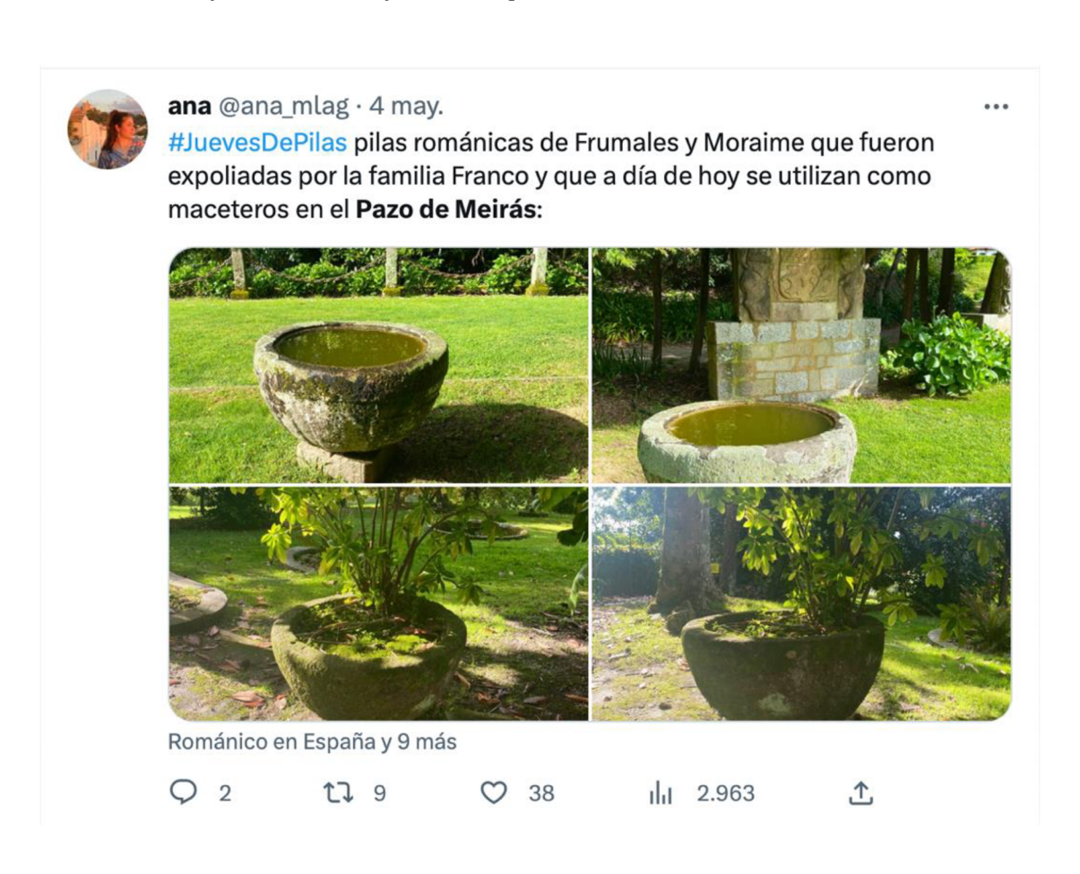
Annex 3. 11<sup>13</sup>: "#BasinThursday Romanesque basins from Frumales and Moraime <u>looted</u> by the Franco family and used today as flowerpot stands in the Pazo de Meirás:"

<sup>13</sup> Ana, Twitter post, May 2023, 10:34 a.m. <a href="https://twitter.com/ana_mlag/status/1654041918345469953">https://twitter.com/ana_mlag/status/1654041918345469953</a>