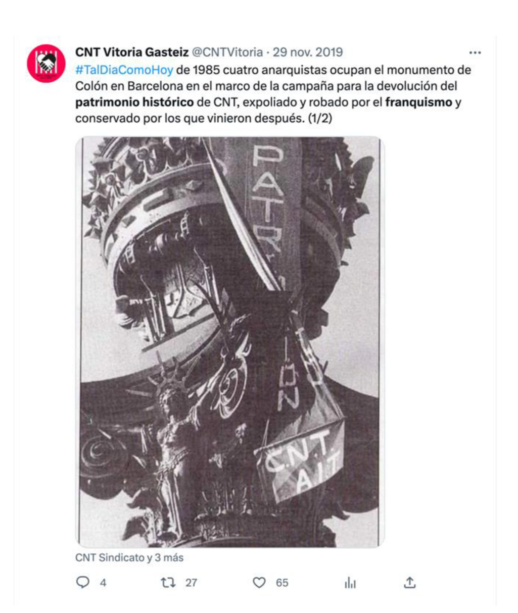
Annex 3. 2 <sup>3</sup>: "#OnADayLikeToday in 1985 four anarchists occupied the Columbus monument in Barcelona in the context of the <u>restoration campaign</u> of the cultural heritage from CNT, <u>looted</u> and stolen by the Francoism and managed by those who came later. (1/2)"

<sup>3</sup> CNT Vitoria Gasteiz, Twitter post, November 2019, 9:18 a.m. https://twitter.com/CNTVitoria/status/1200328116406759424