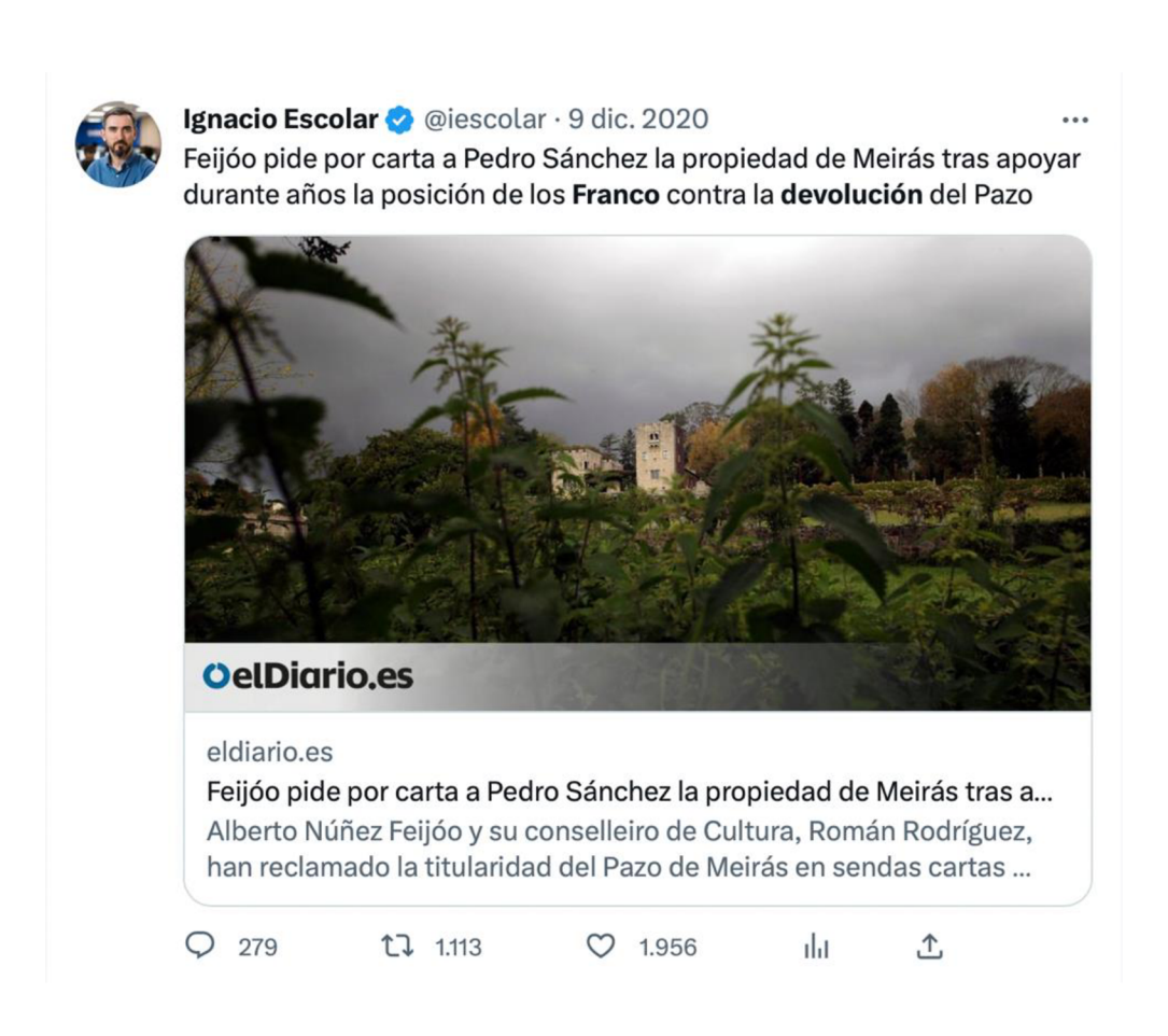
Annex 3. 10 <sup>12</sup>: "Feijóo demands Pedro Sánchez by letter the Meirás property after supporting for years the Francos' stance against the Pazo's return"

<sup>12</sup> Ignacio Escolar, Twitter post, December 2020, 2:13 p.m. <a href="https://twitter.com/iescolar/status/1336660210157576194">https://twitter.com/iescolar/status/1336660210157576194</a>