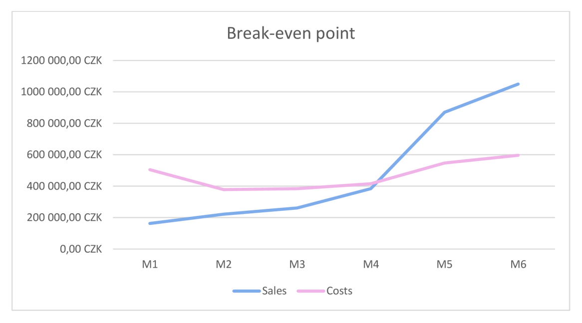
Graph 2 - Break-even point