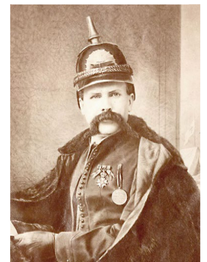
Figure 10: Francis Tubmlety

The last serious suspect was Francis Tumblety (1833-1903). He spent most of his life in the USA and Canada, where he was arrested for supposedly assassinating Abraham Lincoln because of his pseudonym J. H. Blackburn. Such accusation was later taken back. He was present in London while he travelled through Europe. He lived in Whitechapel, being quite aware of the district's requisites. He died in 1903 in St. Louis.