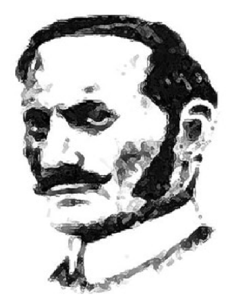
Figure 7: Aaron Kosminski

The second name in the MacNaghten Memorandum was Aaron Kosminski (1865-1919). Kosminski was a Polish barber who emigrated to London around the year 1881. In 1891, he was placed in an asylum for lunatics and died 1891 (House, © 1996-2022).