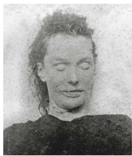
Figure 3: Mortuary photo of Liz

Elizabeth Stride (1843-1888), a.k.a Long Liz, was an occasional prostitute of Swedish origin killed on September 30<sup>th</sup> 1888. She was a quiet woman, although often arrested for public drinking and breaking the law. Her other occupation was sewing and housekeeping.