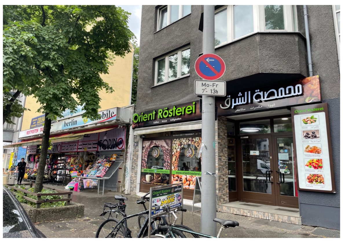
Figure 2. Photo from Sonnenallee. Taken by author, 4 May 2022.

In this chapter, I look into the neighborhood planning of Neukölln and the national rhetoric surrounding it as a "ghetto," leading to the social exclusion of its residents.