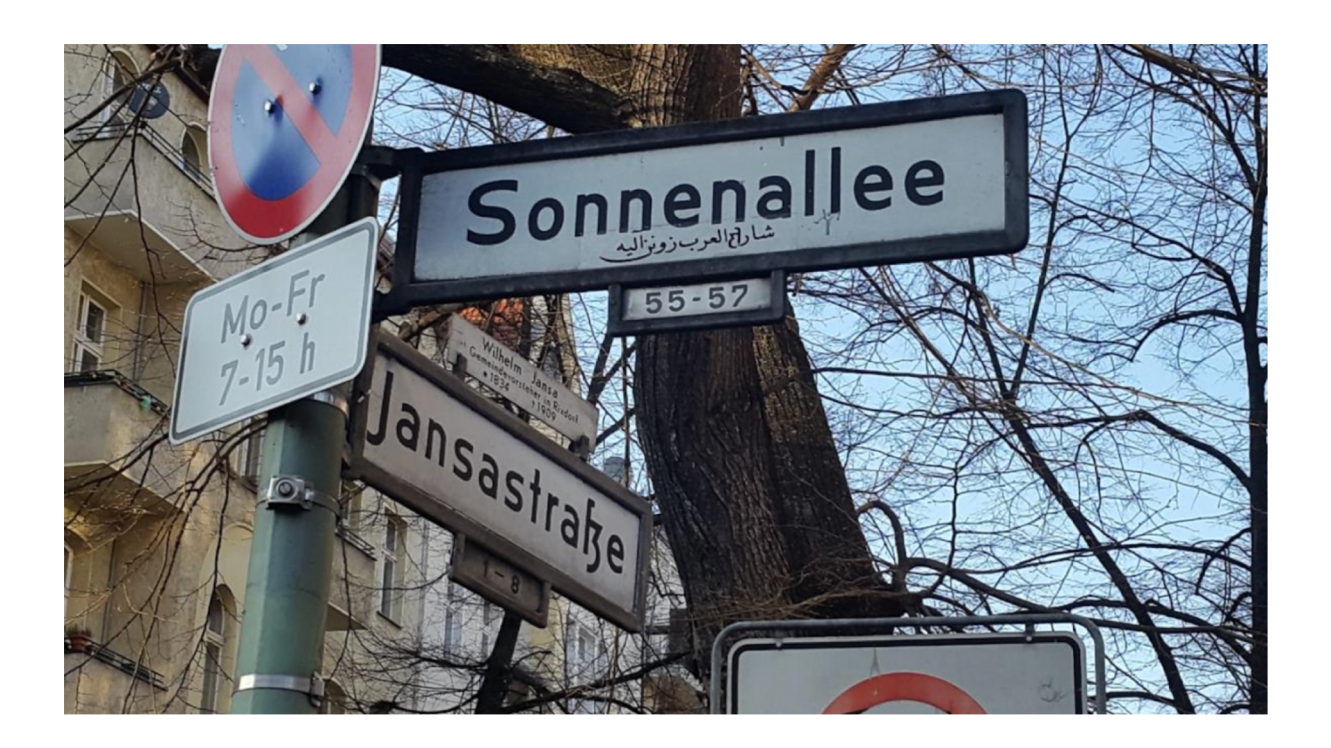
Figure 1. Street sign for Sonnenallee, written in calligraphic Arabic underneath is "Sharea al-Arab Sonnenallee" (Arab Street Sonnenallee).

Syrians' attraction towards the district of Neukölln has been mainly driven by the long-term presence of Lebanese and Palestinian migrants, who have been in Berlin since the late 80s due to the breakout of the Lebanese civil war and the gulf-war which resulted in thousands of refugees. This facilitated their integration and community feeling due to the widespread Arabic language and presence of other Arab grocery stores and restaurants. According to the official district page, thirty-five percent of the inhabitants of Neukölln today are foreigners, and seventy percent of Sonnenallee, in particular, are migrants or have a migration background. The official district page claims that over one hundred and sixty nationalities live in this district alone. Despite all this, prior to the arrival of Syrian refugees, Sonnenallee was still remarkably known for its Arab residents as the street was previously known as "Little Gaza" or "Little Beirut." Therefore, its change to a more inclusive title encompassing all Arabs demonstrates a shift in the demographic of the area. I rely on two