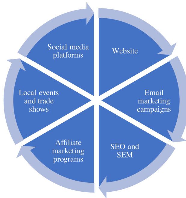
Figure 1 Marketing activities in the company