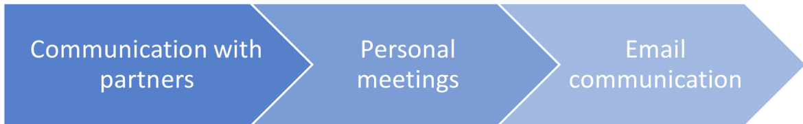
Figure 3 Communication with partners in the company

company to sign contracts or review the terms of cooperation. After this meeting, all communication is carried out mainly through e-mail (see Figure 3).