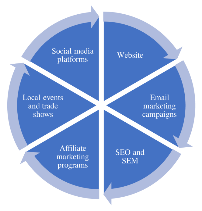
Figure 1 Marketing activities in the company