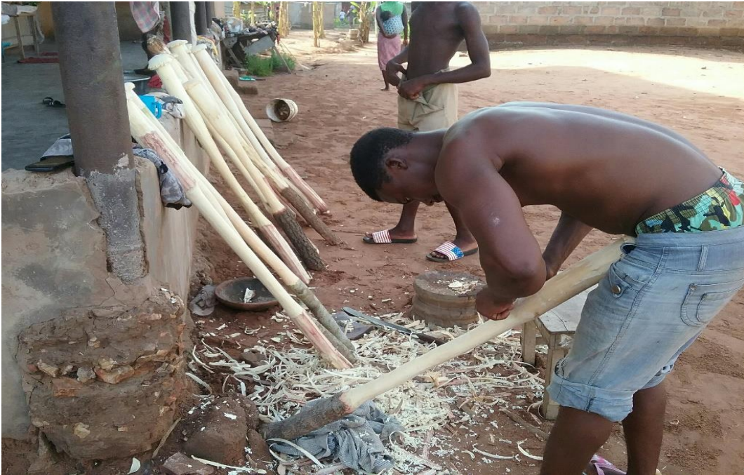
Celtis mildbraedii branches used as pistol for pounding