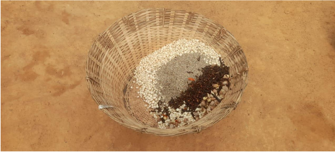
E. guineensis fronds used for local baskets