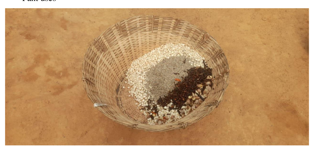
E. guineensis fronds used for local baskets