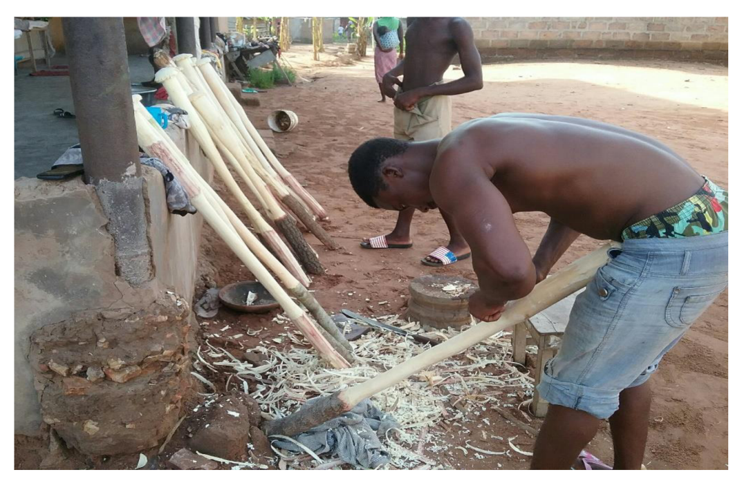
Celtis mildbraedii branches used as pistol for pounding