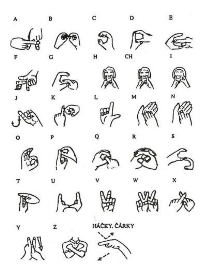
Figure 3: Czech one-handed alphabet (Potměšil, 1992, p.11)