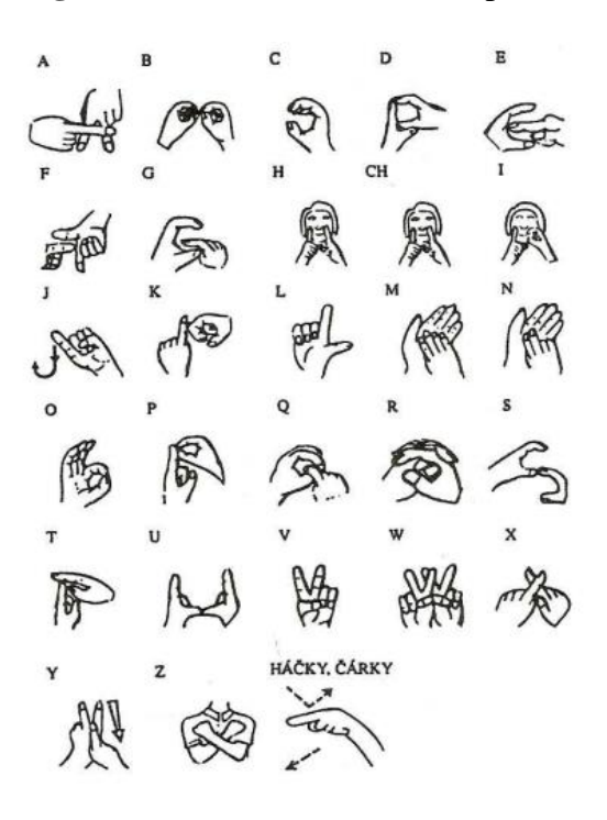
Figure 4: Czech two – handed alphabet (available from: <u>dvourucni prstova abeceda.pdf</u> (<u>muni.cz</u>))

Figure 3: Czech one – handed alphabet (available from: Potměšil, 1992, s. 11)