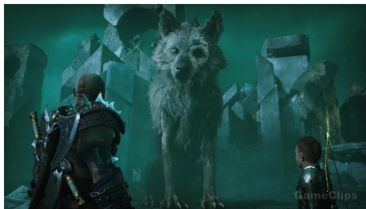
Figure 6: Fenrir in God of War: Ragnarok [153]

Fenrir can also be seen in God of War: Ragnarok . At the beginning of the game, Fenrir is a wolf owned by Loki. For Loki, Fenrir is his family and someone he takes care of. Not a few minutes into the game, Fenrir dies of sickness, and his soul leaves his body. Atreus casts a spell, so his friend's soul is transferred into a knife. Atreus uses Fenrir's soul during the battle with Garm. His little soul enters the former prisoner of Helheim, which resurrects Fenrir, who aids them during Ragnarok. [151] Fenrir looks like a normal-looking wolf, except for his height. He has huge claws and fangs that can be seen even with his closed mouth. Fenrir's half face is white-marked, otherwise, his whole body is dark colored in black/grey. Atreus and Kratos also sometimes call him a "Good boy". [152]