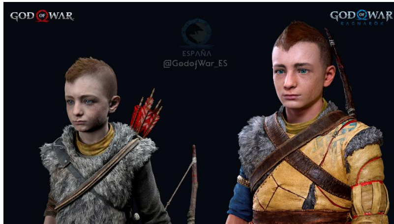
Figure 5: Atreus (Loki) in God of War [143]

Because Atreus spent his childhood with his mother, who was a Norse god, she taught him how to read runes, and told him the stories of gods and other realms. As the game progress, players will find various runes which the boy can read and retell the mythological stories by himself.