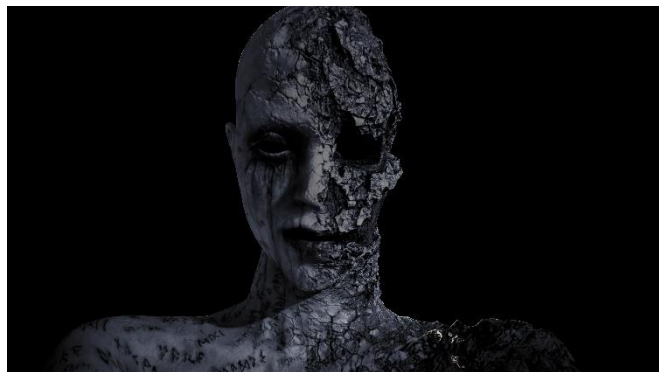
Figure 8: Hel in Hellblade: Senua's Sacrifice [164]

There are not many Hel depictions in the real world, and the only visualization we have comes from old book sources like Prose Edda. Unfortunately, we cannot compare that much of a real-life representation of Hel to her video game depiction.