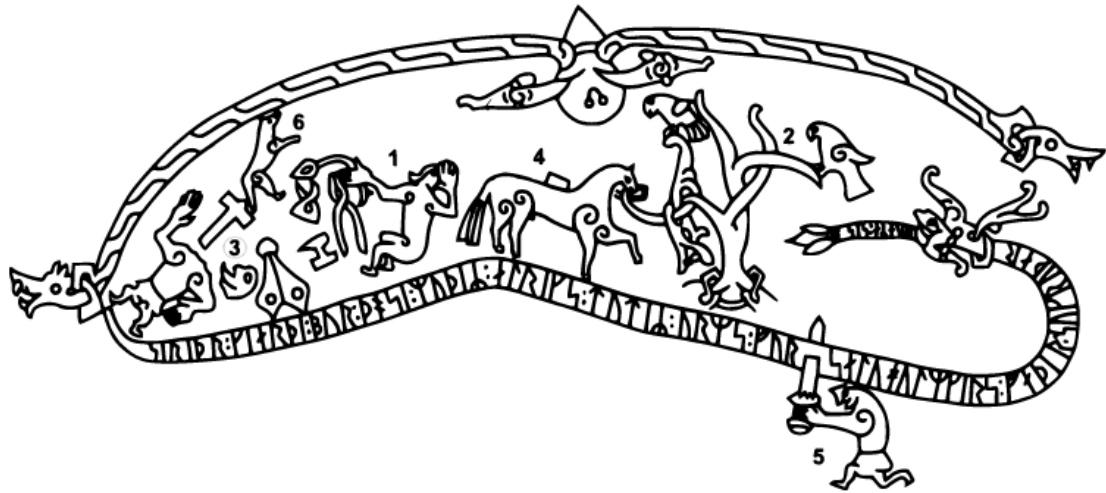
Figure 1: Ramsund Inscription [90]

Do these runestones represent Norse mythology in a particular way? Archeologists have discovered stone built into a Rök church wall in the 19 th century, which carried a mention of Thor – the god of thunder. This stone was removed from the church wall in Rök, Sweden, and placed just beside him under a very primitive wooden structure. The Rök runestone is one of the most famous runestones, carrying the longest runic inscription, which has been important for both theological and historical views. [91] It also references Theodoric the Great, who has been an Ostrogothic king. This runestone is not the only one showing us some Norse gods. The next one I will mention is Altuna runestone. This one also reveals Thor with Hymir, but this time he is trying to fish the Midgard Serpent Jormungandr. Thor is using an ox head as bait, but as told in the Gylfaginning of the Prose Edda, the fishing line is cut loose by Hymir. Prose Edda also mentions that Thor’s foot went through the boat when fishing, which can be clearly seen at the runestone. [92] The last runestone I am going to mention is the Ledberg stone picturing the Ragnarok scene. Fenrir, son of Loki, is devouring Odin. Under this visualization lies Odin, already without legs and with hands in front of him. [93]