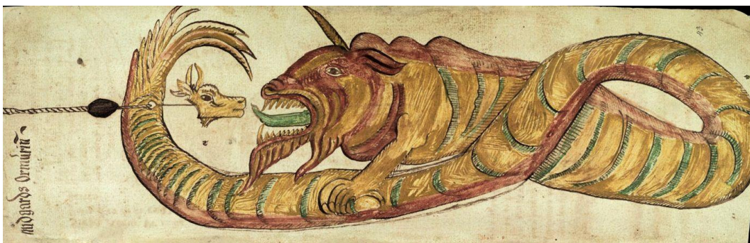
Figure 7 Jormungandr [157]

Portrayed in Figure 5, we can see giant Midgard serpent Jormungandr leaping towards the ox head, as depicted in this tale. [156]