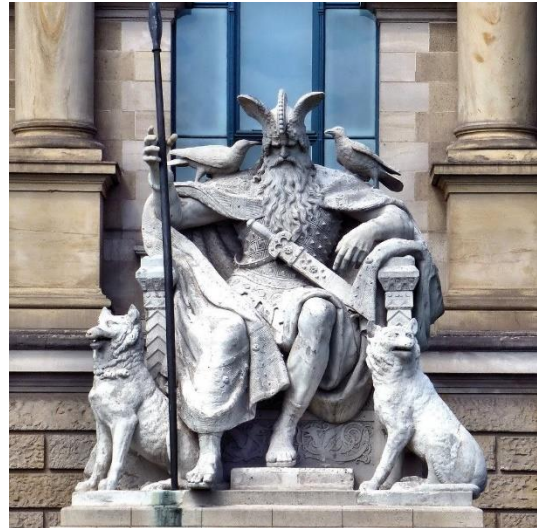
Figure 4. [120]

Probably the greatest modern art visualizing Odin I would consider to be in Hanover, Germany. The limestone statue was established in 1902 and currently stands behind the Museum of Lower Saxony. Sadly, the statue was damaged during World War II and put completely back up in 1987. The sculpture was created by Friedrich Wilhelm Engelhard, who created many sculptures of other gods like Thor, Baldur, and Valkyries, and his best work, the Edda frieze. Friedrich made Odin sitting on his throne, wielding a great black spear. Same as in the illumination from the 18 th century, two ravens are sitting on his shoulders, and also two wolves are by his feet. Odin is wearing a winged helmet, comparable to Thor's. After closely examining his armor, it looks like he is wearing light leather armor, maybe a fancy chainmail, with a leather armor skirt and a cloak over his back. And finally, he has a great long beard. This statue can be seen in