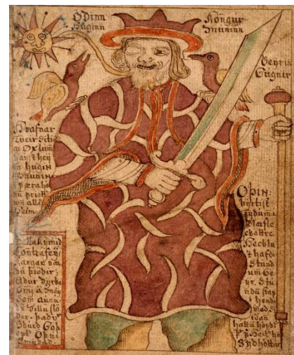
Figure 3: Odin [119]