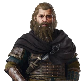
Figure 2: Thor in Assassin's Creed Valhalla [106]

Marvel may have involved Norse mythology heavily in their work, but they are definitely not the only ones. Many people, or at least gamers, are familiar with the Assassin's Creed series. One of their best titles – Valhalla , has achieved 1 billion dollars in revenue, which makes this the most profitable game of the whole series. This is according to the Screenrant. [105] This game shows us the true life of Vikings (not including the rap battles) and even gods. Thor here looks nothing like the one from Marvel. Brown hair, a long beard with fancy braids knitted in it. Dressed in heavy leather armor with a dark brown cloak on his back. With a dagger under his right arm and Mjolnir hidden under his cloak, he seems like a great warrior. When talking with Thor, he doesn't have a problem with joking, or at least if he is not drunk, and if needed, gamers can even have a rap battle with Thor, and it's just up to them if the god will “outrap” them. This game is also not suitable for children, as there is a lot of killing, but also curse words, and Thor is not afraid to use them: “Buri's ballsack!” In Valhalla , it's also possible to acquire Thor's armor. Golden-plated armor, decorated with blue cloth and fur around the neck, this armor looks truly majestic and is a lot different than that one Marvel had.