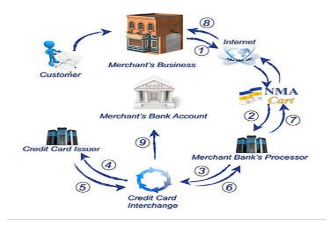
Figure 2 working mechanism of E-commerce

From (www.nationalmerchants.org/services/ecommerce.php)