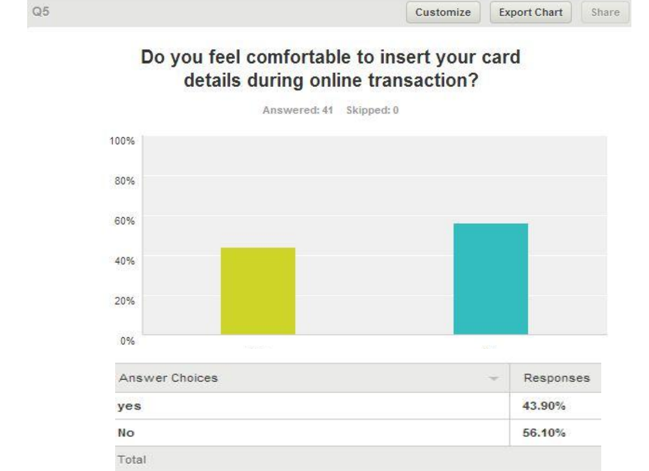
Figure 3 Question description first

It shows 55%+ respondent don't feel comfortable to insert card detail.