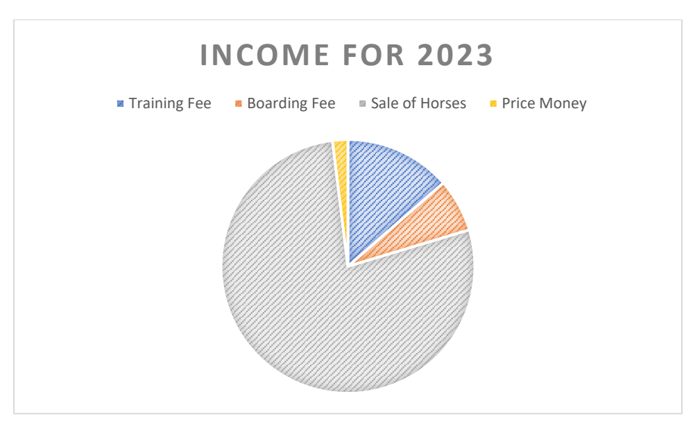
Graph1 Income Decompostion for 2023 of BWG, author's processing