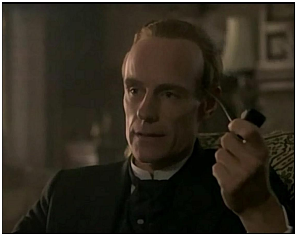
Picture 2: Sherlock Holmes in The Hound of the Baskervilles (Canada, 2000) [22]