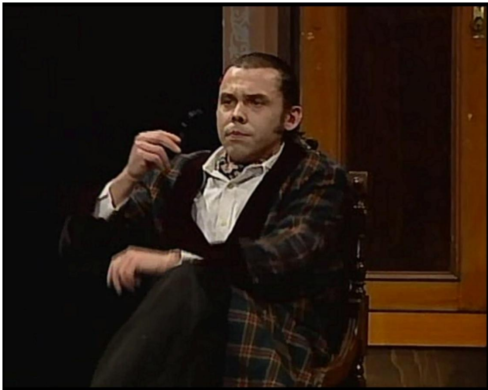
Picture 4 Sherlock Holmes in drama Prokletí rodu Baskervillů aneb Pozor zlý pes! (Czech Republic, 2004) [26]