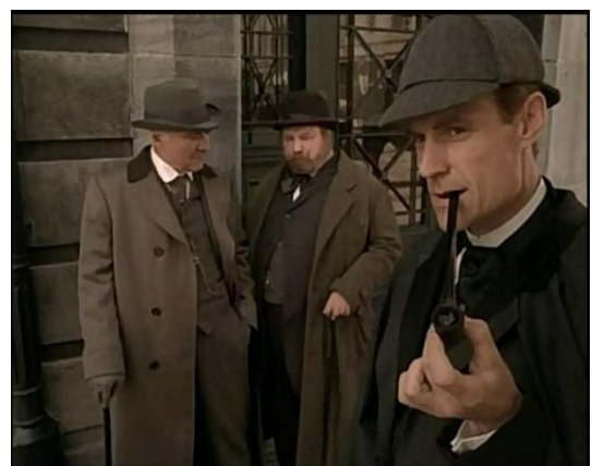
Picture 3 Sherlock Holmes in tweed coat and deerstalker cap with his tobacco pipe [22]