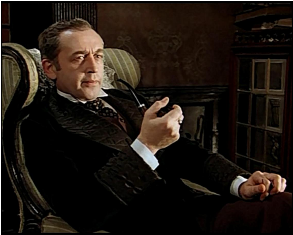
Picture 1: Sherlock Holmes in The adventures of Sherlock Holmes & Dr. Watson: The Hound of the Baskervilles (The Soviet Union, 1981) [20]