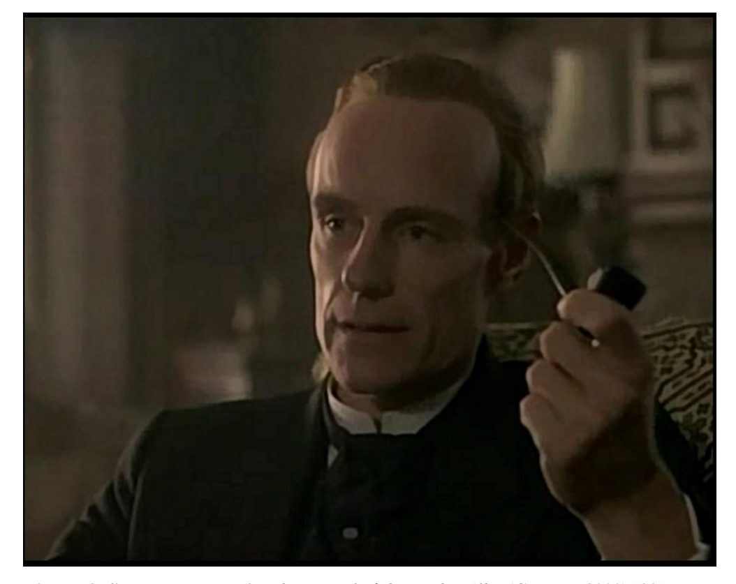
Picture 2: Sherlock Holmes in The Hound of the Baskervilles (Canada, 2000) [22]