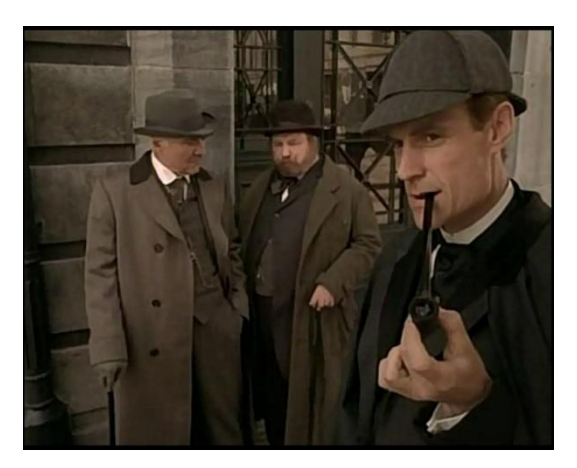
Picture 3 Sherlock Holmes in tweed coat and deerstalker cap with his tobacco pipe [22]