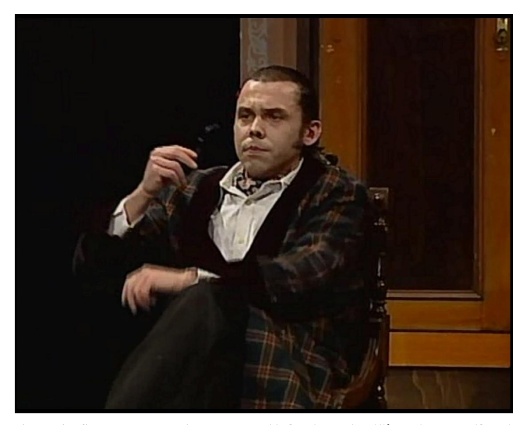
Picture 4 Sherlock Holmes in drama Prokletí rodu Baskervillů aneb Pozor zlý pes! (Czech Republic, 2004) [26]