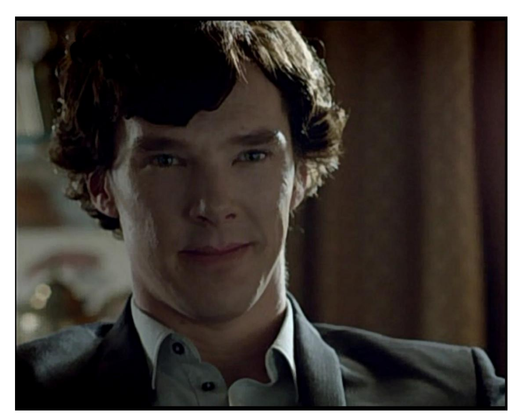
Picture 3 Sherlock Holmes in series Sherlock: The Hounds of Baskerville (Season 2, Episode 2, Great Britain, 2012) [24]