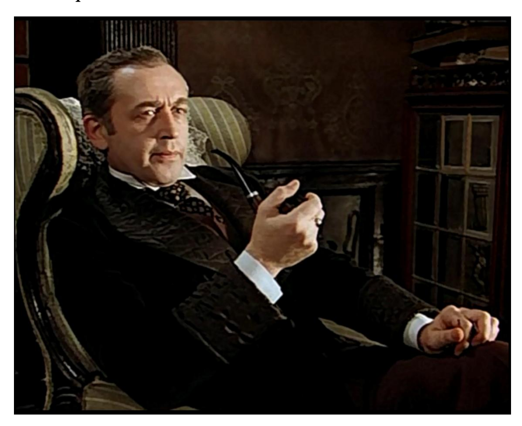
Picture 1: Sherlock Holmes in The adventures of Sherlock Holmes & Dr. Watson: The Hound of the Baskervilles (The Soviet Union, 1981) [20]