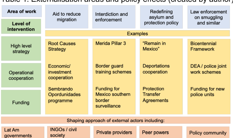
Table 1: Externalisation areas and policy effects (created by author)