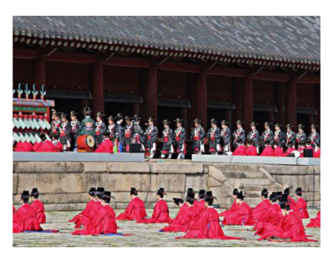
Fig. 5: Performance of the Rite to Royal Ancestors at the National Gugak Center (left)