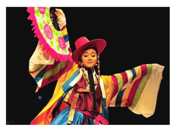
Fig. 1: A shamanness performing a ritual dance<sup>7</sup>