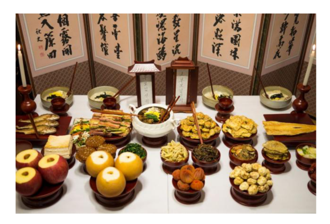
Fig. 4: An example of the food setting on the altar