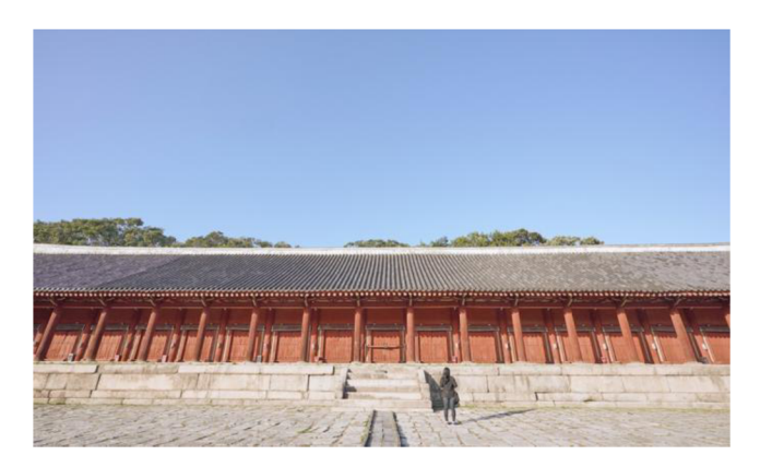
Fig. 2: Chongmyo shrine