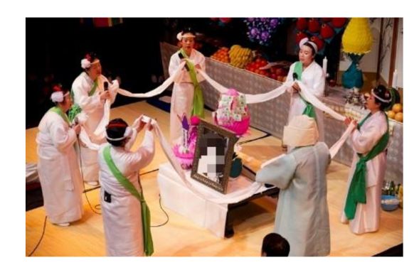
Fig. 3: A group of mudang performing ogu-kut (also known as chinogwi-kut )

According to shamanic stories, Princess Pari is a spirit of a former princess, who was abandoned by her parents after her birth, as they wished for a son instead. When they were on their deathbed, she set out on a perilous journey to the underworld and back to retrieve medicine that would cure them. Due to her supernatural power to cross the bridge between the secular and sacred world, Princess Pari is essential to the chinogwi-kut . Many mudang even identify Princess Pari, as their common ancestor, which makes her significant not only in context of shamanic spirit worship, but to the whole culture of Korean shamanism.