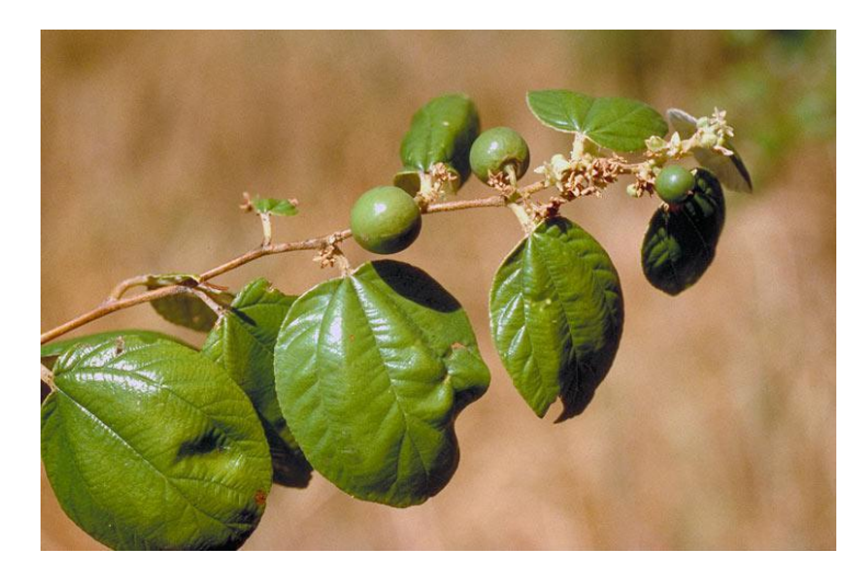
Appendix IV. Ziziphus jujuba: (Useful Tropical Plant Database 2014)