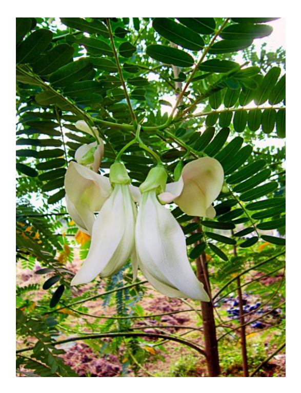
Appendix II. Sesbania grandiflora: (Useful Tropical Plant Database 2014)