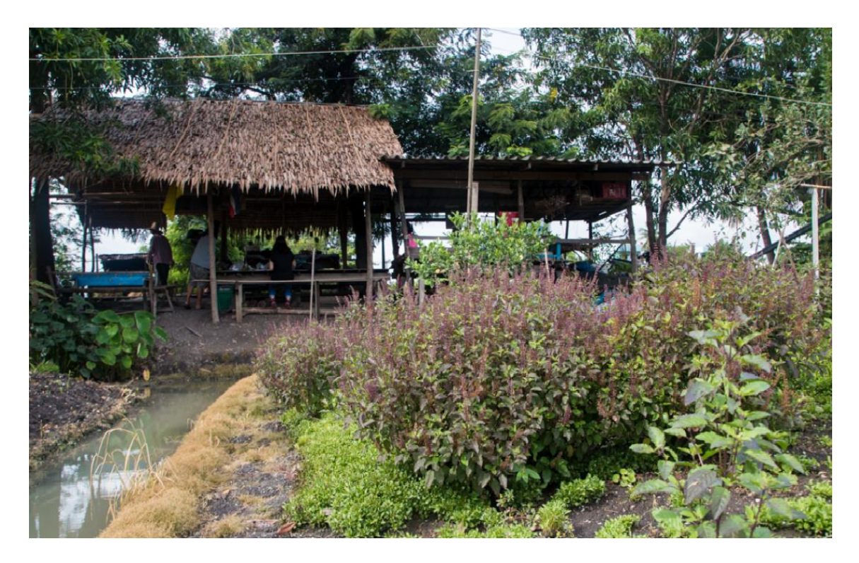
Figure 2. Thai homegarden: (Wiens 2021)