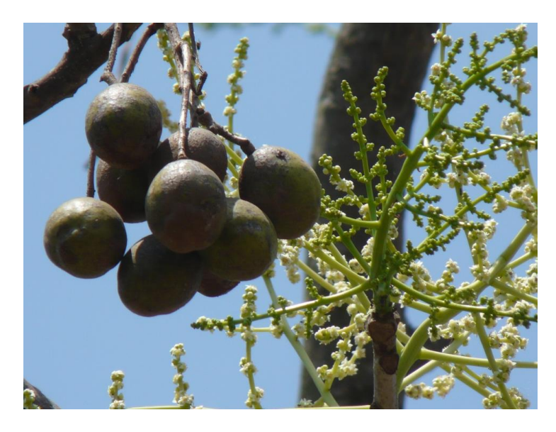
Appendix III. Spondias pinnata: (Useful Tropical Plant Database 2014)