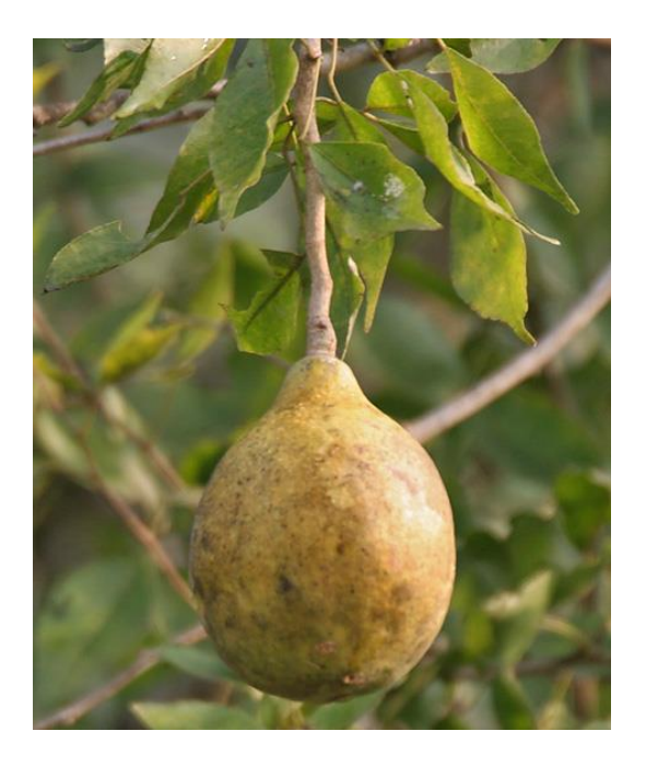
Appendix I. Aegle marmelos: (Useful Tropical Plant Database 2014)

Appendices: Photos of the most promising Thai underutilized species