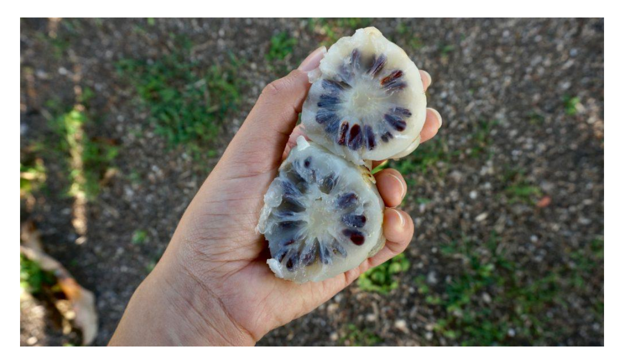
Figure 4. Morinda citrifolia: (Our Tropical Soil 2019)

During the Green Revolution, the focus of agricultural research was on increasing quantity, not quality. As a result, diets deficient in essential micronutrients and vitamins persist in less developed parts of the world. Underutilized species have the potential to contribute to food security at local and regional levels. Due to their significant nutritional values, they are a tool to combat undernourishment and lack of minerals in human nutrition. Species that are rich in antioxidants can even help to fight against diseases of affluence such as CVD_S and cancer. At the national level, underutilized species can strengthen the food and buffer economy of the country as well as the social shock that might occur because of concentrating on fewer and fewer crops. Underutilized species have lower yields but are more resistant to biotic stresses than well-known high-yield crops. They provide dependable harvests on poor soils or in unfavourable climatic conditions (Padulosi et al. 2013).