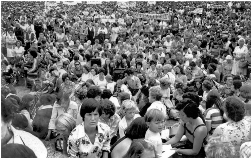
Figure 2: Protesters against ongoing violence in Northern Ireland gathering on Shankill Road, Belfast, Northern Ireland, August 1976.

Retrieved from: https://www.britannica.com/event/The-Troubles-Northern-Ireland-history/The-Sunningdale-Agreement-hunger-strikes-Bobby-Sands-and-the-Brighton-bombing