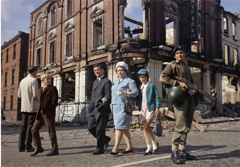
Figure 1: Local people walking past a British soldier on guard in Northern Ireland, August 1969.

Retrieved from: https://www.britannica.com/event/The-Troubles-Northern-Ireland-history/The-Sunningdale-Agreement-hunger-strikes-Bobby-Sands-and-the-Brighton-bombing