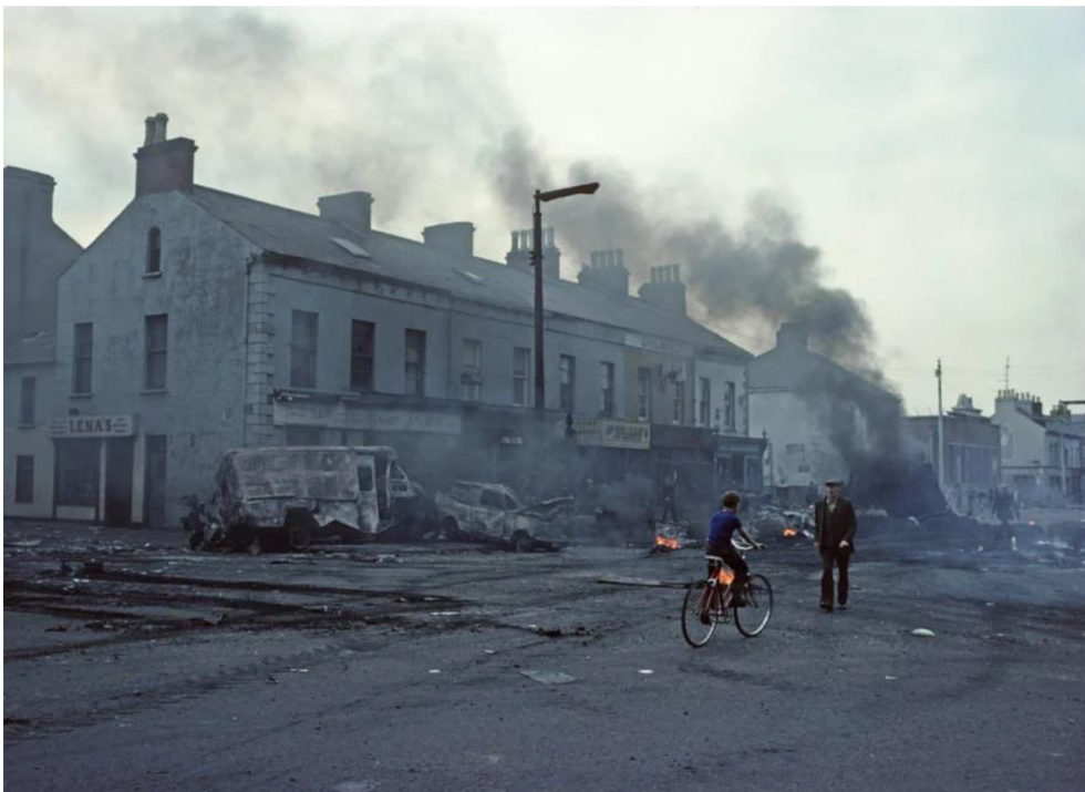
Figure 4: A young boy and an old man stand amid the destruction following a night of riots in the Falls Road in West Belfast. August 1976.