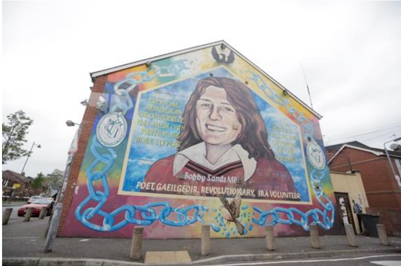
Figure 5: Bobby Sands