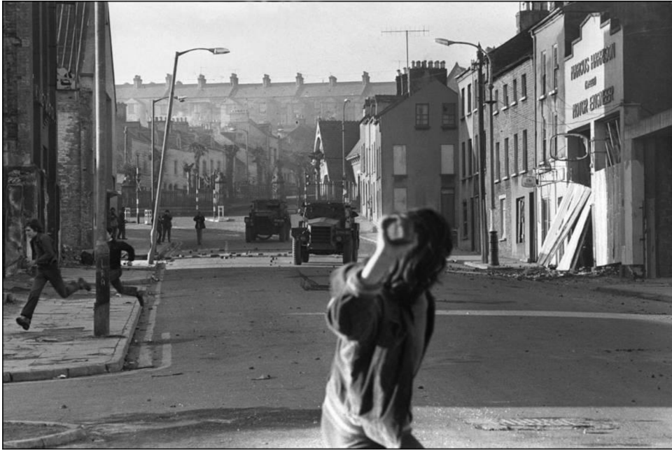
Figure 3: A young Catholic rioter throws a stone at a British armored jeep during a rally in Londonderry protesting the recent Bloody Sunday killings. March 2, 1972.