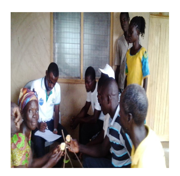
Appendix 3. Focus Group interviews