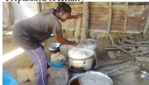
Preparation of Tuozaafi / Banku