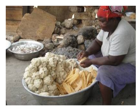
Appendix 5. Different Preparation techniques of selected FPFs and a community house in Paga Zenga (Source: Author's Personal Observation, 2015).