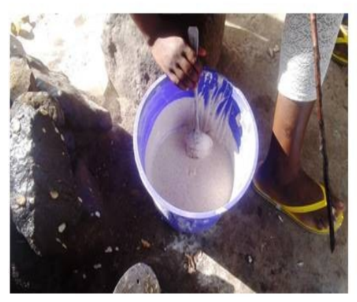
Preparation of Koose