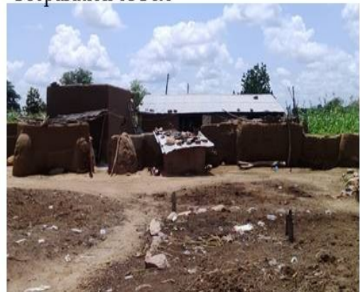
Community house in P. Zenga