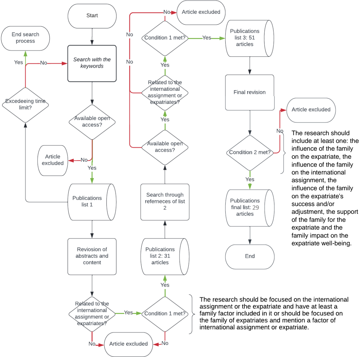
Figure 2. Flow chart of the methodology.

the family on the international assignment, the influence of the family on the expatriate's success and/or adjustment, the support of the family for the expatriate and the family impact on the expatriate well-being) and if the articles did not include at least one of them, they were considered irrelevant. This left the final pool of 29 articles that were reviewed and presented in this thesis. The whole process is presented with the use of a flow chart below (Figure 2).