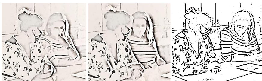
Figure #4 Figure #5 Figure #6

12 ST1 eh +(.)+children um, +Makes EC with ST2 +ST2 Gazes at ST1 13 ST1 th- make+ oppo+rtunities what they +ST2 Gazes at WS +Gazes at WS 14 ST1 can do, their life just consists in front of 15 ST1 the TV or in front of the in+ternet, +ST2 Leans back 16 ST1 so,+ maybe it+'s different, then, yo+ur opinion. +Gazes at ST2 (#4) +ST2 makes EC with ST1(#5) +ST2 Leans forward +ST2 Gazes at WS(#6)