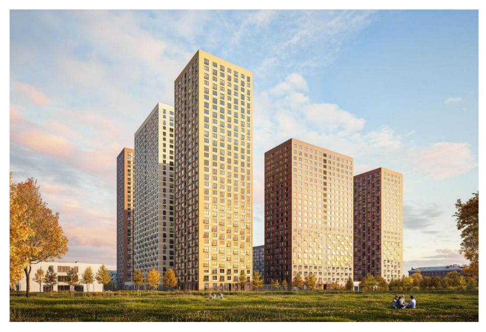
Figure 4: Residential complex project