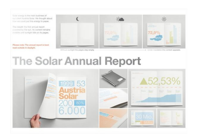
Picture 3. Austria Solar Annual Report. Copyright: Austria Solar, 2012.

The result of transcultural hybridization of sustainable development values of Austria, media culture and new technology has been realized in the form of a special cultural item – an annual report, which can be read only under the sun. The technology, used for the sake of the project – printing with the help of environmentally friendly photo chromatic colors, which are not possible to recognize without UV exposure. The reaction of the global community to this innovation has been remarkable. The company received 400 requests across the globe for a copy of their annual report from GreenPeace, Ted conference, Ernest&Young and others<sup>85</sup>. The outcome of this advertising campaign increased the amount of clients for the printing company, which fulfilled the order of solar report and moreover, proved the image of Austria, as a country with environmentally-friendly business and sustainable development.