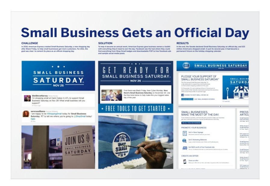
Picture 6. Small business day American Express.

motivation to change food culture by involving consumers into the process of raising funds for the Cultivate Foundation and FarmAid. People had to buy the soundtrack of the song on Itunes in order to participate in the investment of the nutritional industry problem solutions. As it is stated in the synopsis of the advertisements, Back to the start campaign also initiated conversation in pop-culture. In 9 days the film earned 11.024870 endorsement on the Twitter and 5071 reposts in other social networks, forums and news<sup>89</sup>. The transcultural hybridity of this advertisement can be described as a peculiar network of a company and consumer, who absorbs the enterprise food culture principles into individual cultural field and therefore, modifies his style of living. The result of such networking – transformation of the individual into the agent, which invests in the new cultural message and finances the distribution of a new cultural message.