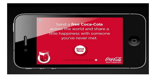
Picture 10. Google application "Buy a world a coke".

First example in this group belongs to Google, which re-imagined famous Coca-Cola Hilltop advertising campaign, which was popular in the 70s.