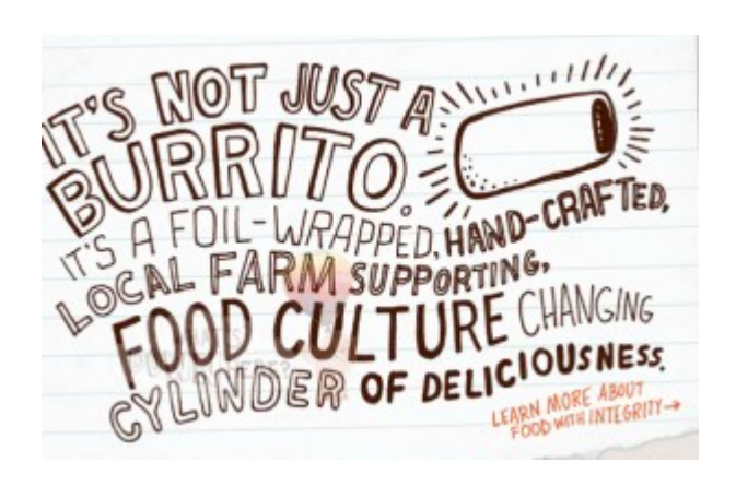
Picture 5. Chipotle advertising campaign Cultivate.

People responded instinctively to the new technology, represented on the street with the desire for the new product, which liberates their fears of harm to the planet.