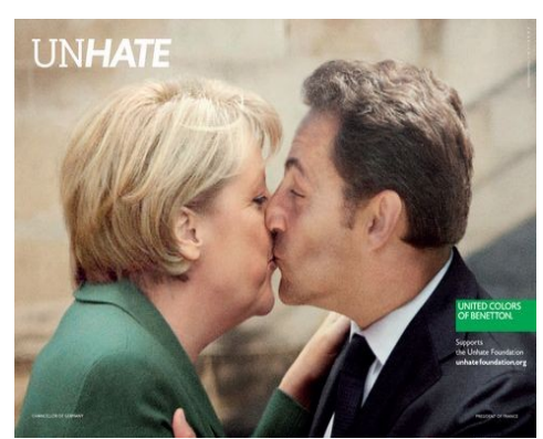
Picture 11. United Colors of Benetton "Unhate".

The winner of Cannes Lions Grand Prix 2012 Press - United Colors of Benetton launched a campaign in order to promote tolerance and acceptance between cultures. The persuasive sign, which has been used on the posters of the brand – a universal sign of peace and love – a kiss<sup>96</sup>. The posters represent political leaders of different countries of the world in the pose of kissing. This advertisement can be considered as a significant example of transcultural advertising. Politicians are engaged in the discours and can have different opinions on the global issues, but even them accept in their zone of comfort an opponent in order to express the will to compromise and be tolerant.