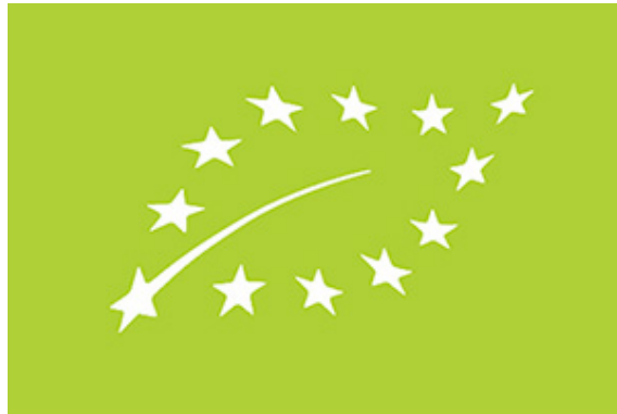
Figure 2 European Union's organic logo

To obtain the EU organic logo, farmer must contact the authority responsible for organic controls in corresponding Member State. An inspector visits the farm and checks and approves all activities. Then he receives a certificate to be able to use the organic logo on his products. The inspector conducts regular check-ups at least once a year.