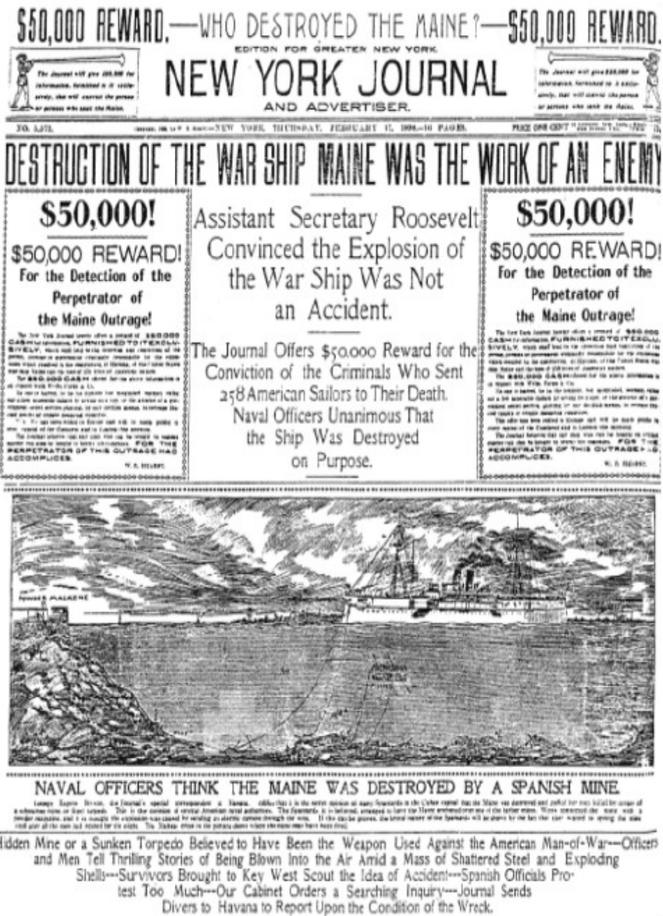
New York Journal article on the sinking of the USS Maine