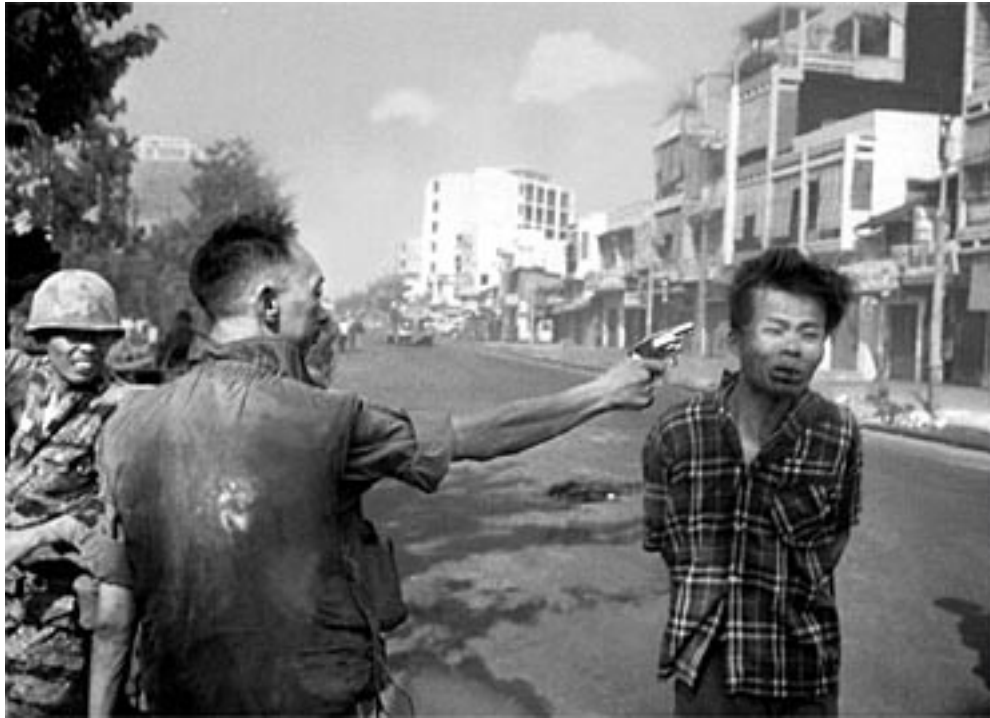
Nguyen Ngoc Loan executes VC prisoner