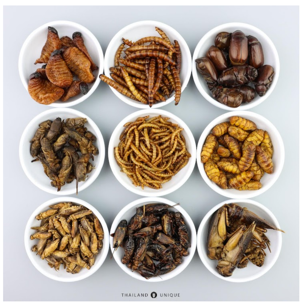
Označte jen jednu elipsu.

18. 18. Insects carry many health beneficial properties, they contain high amount of protein, healthy fats, calcium, and omega-3s. Furthermore, insect farming requires less land, less water, less feed, and it produces less greenhouse gases. Consumption of insects can be in any form – direct, protein powder, protein bars, or even pasta. Would you consider adding insects to your diet? *