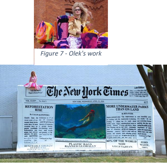
Figure 6 "Turn the Page" in Virginia

This artist has on her account a lot of diverse artwork that cannot be overlooked. She is helping communities worldwide and wants to change the world filled with conflicts, wars and natural disasters. She wants to see the world filled with love. Among her other works, one can find a giant knitted page of The New York Times with the title about the oceans. The purpose is to raise awareness of the ocean life-support system of our planet, to deliver the alarming message about the disturbing state of our oceans due to the usage of plastic bags and bottles.