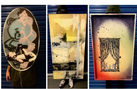
Figure 10 Trashbird's works

Art typically expresses social problems and may encompass political connotations in the form of a critique. An anonymous street artist says: