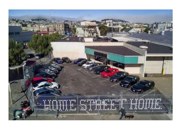
Figure 2 Home street home installation in San Francisco

Street installations are another form of street art which is not made on walls but uses three-dimensional objects. The important aspect of installations is the choice of a place. Installations can stand alone or may be also fixed to a wall. Street art installations may merge various techniques. An example can be a stencilled scene of a child pulling a wagon, created by the artist Snyder. The actual wagon part is included and attached to the wall. Paige Smith uses different materials to fill out the cracks in the walls. Another installation in San Francisco is made up of laser-cut plastic, arranged to look like stitching with a sign 'Home street home'. It points at raising awareness of the rising number of homeless and is a reminder that for some people, the cement is a bed and streets are home. <sup>17</sup>