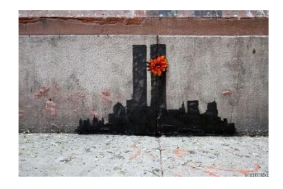
Figure 4 Banksy's tribute

Manhattan's Tribeca neighbourhood is seen Banksy's street art tribute consisting of stencilled Twin Towers with a flower placed instead of an explosion.<sup>61</sup>