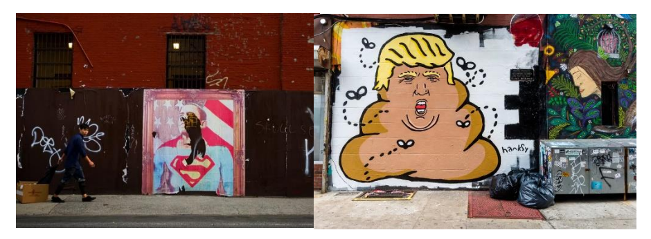
Figure 12 Barack Obama in the streets of Los Angeles and Hanksy's Donald Trump mural

Barack Obama was depicted in superman clothes.<sup>87</sup> Later, during presidential elections of Donald Trump, throughout the streets of United States appeared a lot of anti-Trump